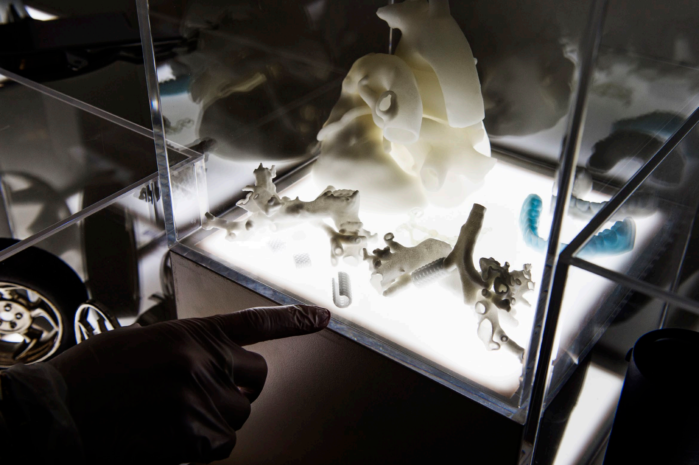
Civitanova Marche, (Macerata). 3D printed medical devices created by Prosilas prior to the COVID-19 emergency.