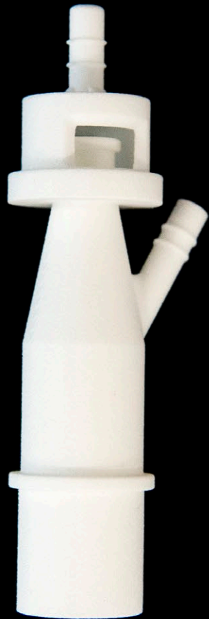
Civitanova Marche (Macerata). Hospital ventilator valves produced by the company Prosilas.