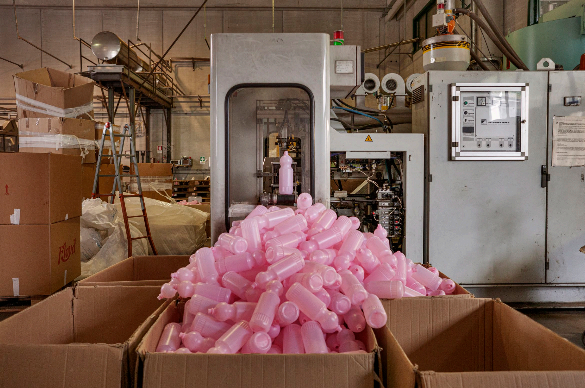
Antica Distilleria Russo, Mercato San Severino (Salerno). A machine that produces bottles for alcohol. The Covid-19 emergency has had a notable impact on production and the factory is currently working 3 shifts, 24 hours a day.