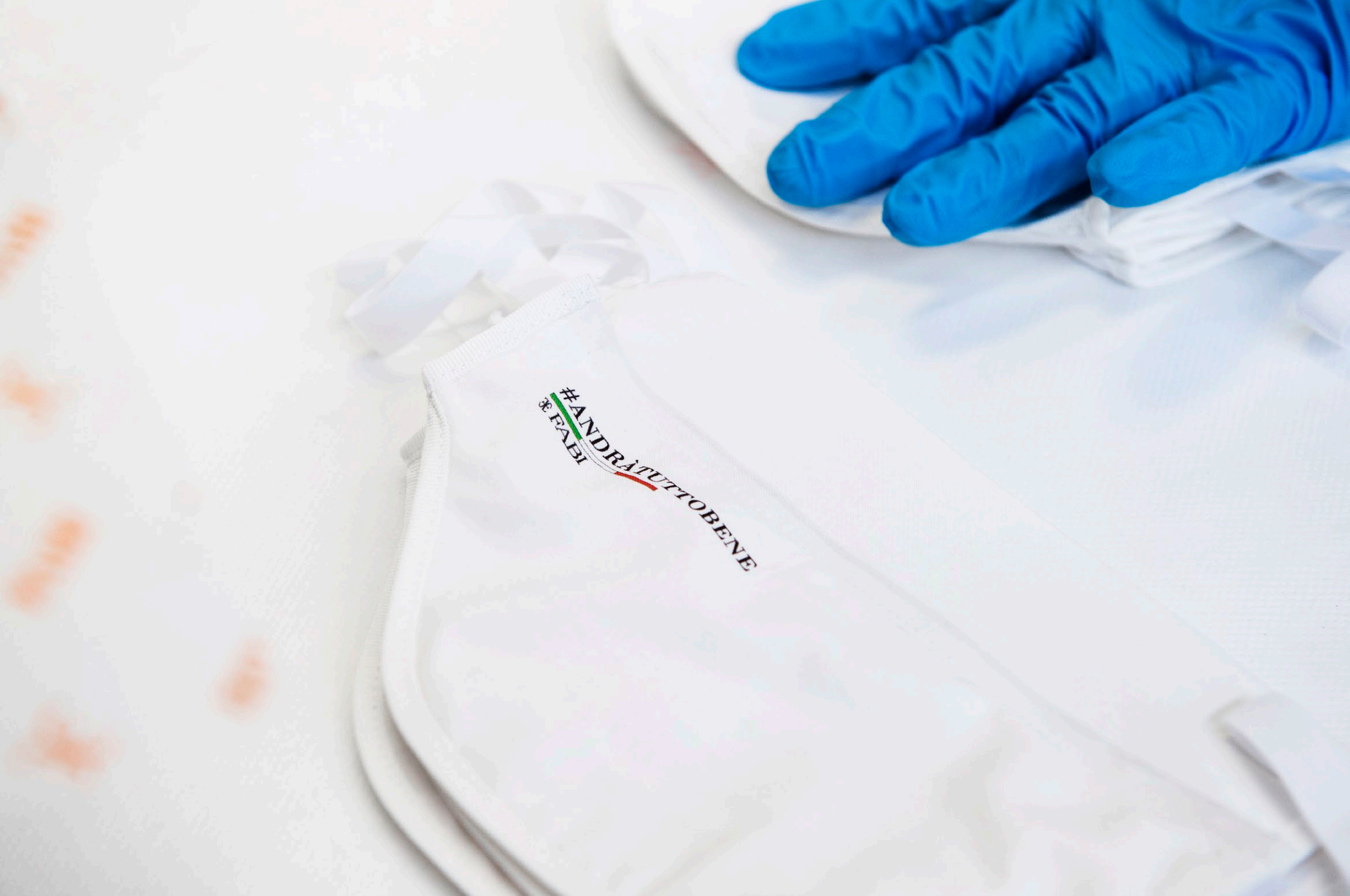
Monte San Giusto (Macerata). Part of a face mask made by Fabi Spa, all of the masks produced are supplied free of charge to local health authorities.