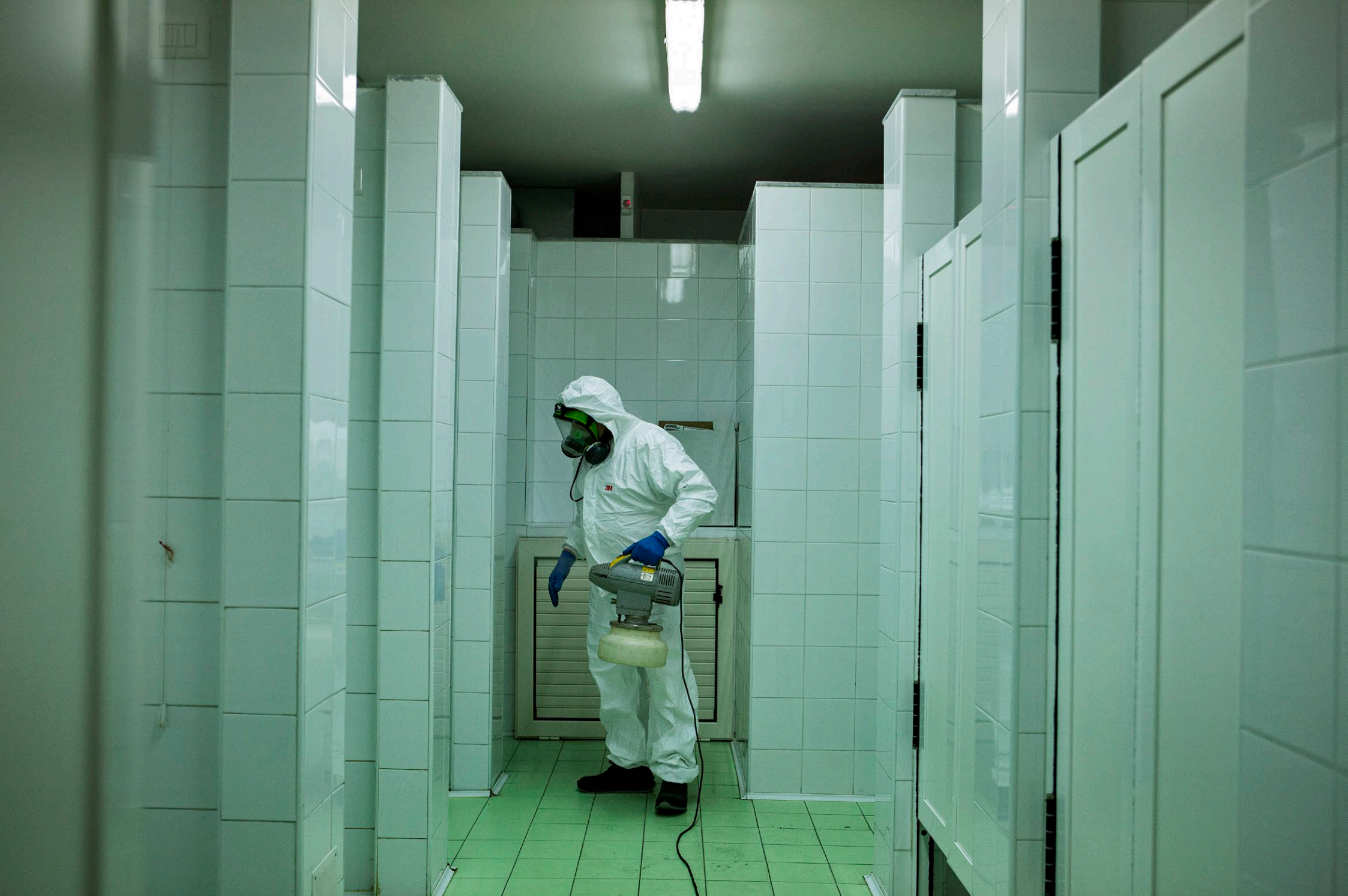
A worker from the company Proverbio Service (Cava De' Tirreni Salerno) deep cleaning the employees' changing rooms.