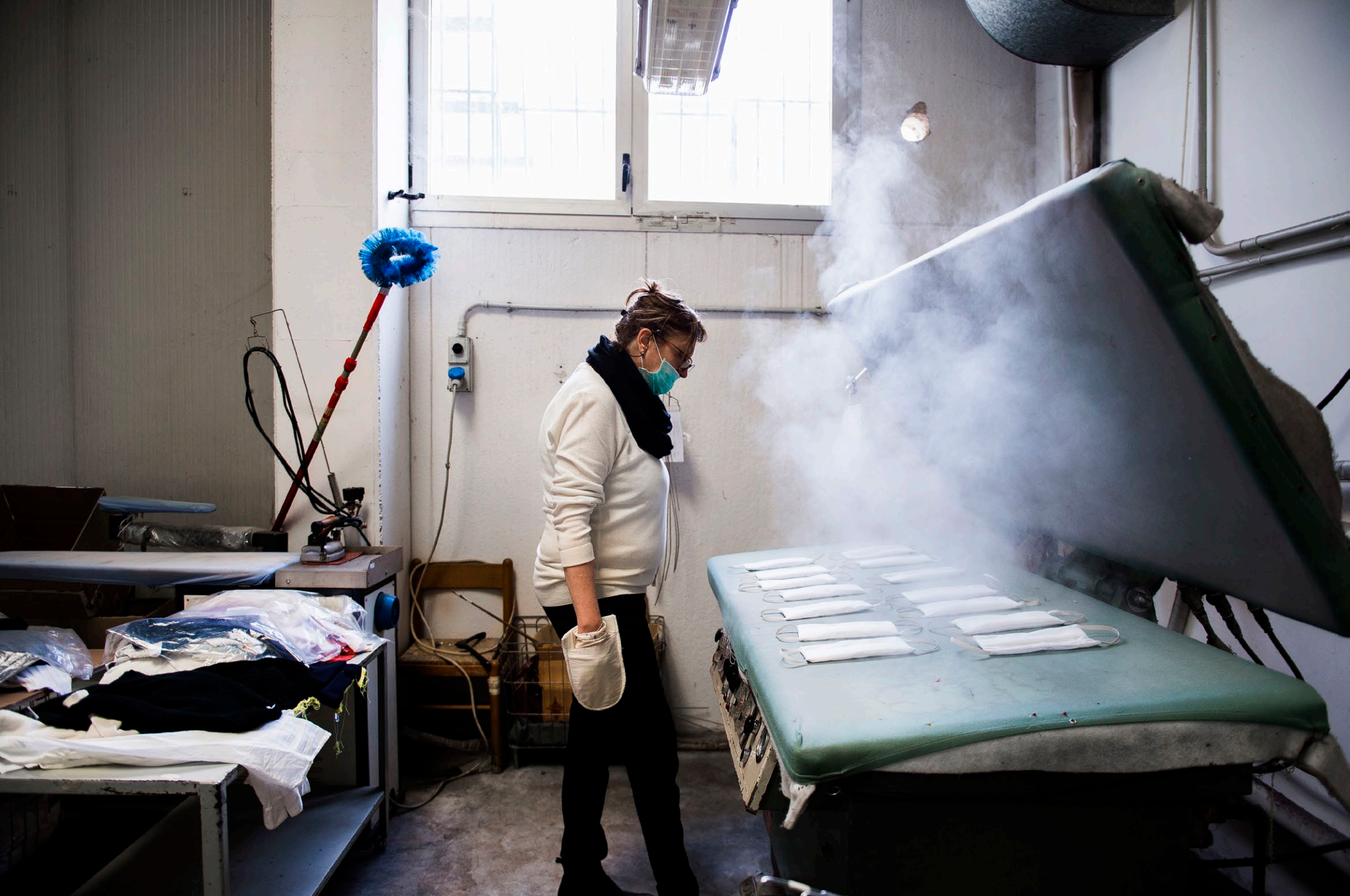
Castelfidardo (Ancona). At the company Bafy, an employee uses a machine to press face masks.