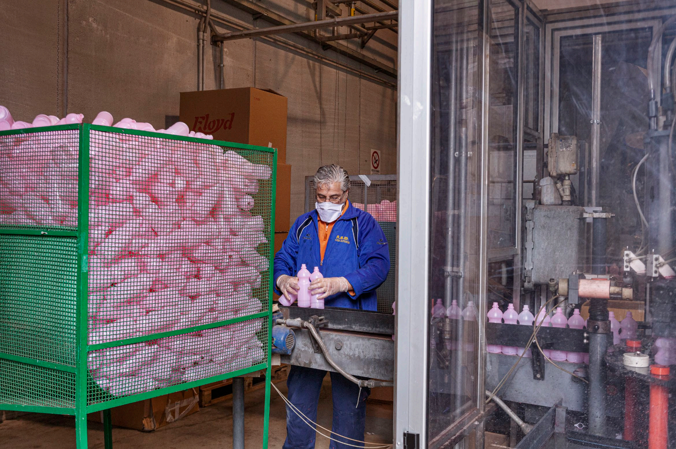
Antica Distilleria Russo, Mercato San Severino (Salerno). A worker on one of the bottling lines. Due to the Covid-19 epidemic, the company has seen demand for distilled spirits collapse, but it has also seen an exponential rise in the demand for denatured alcohol, or processed products such as hand sanitizer. Before, these represented only a small part of the company's production.