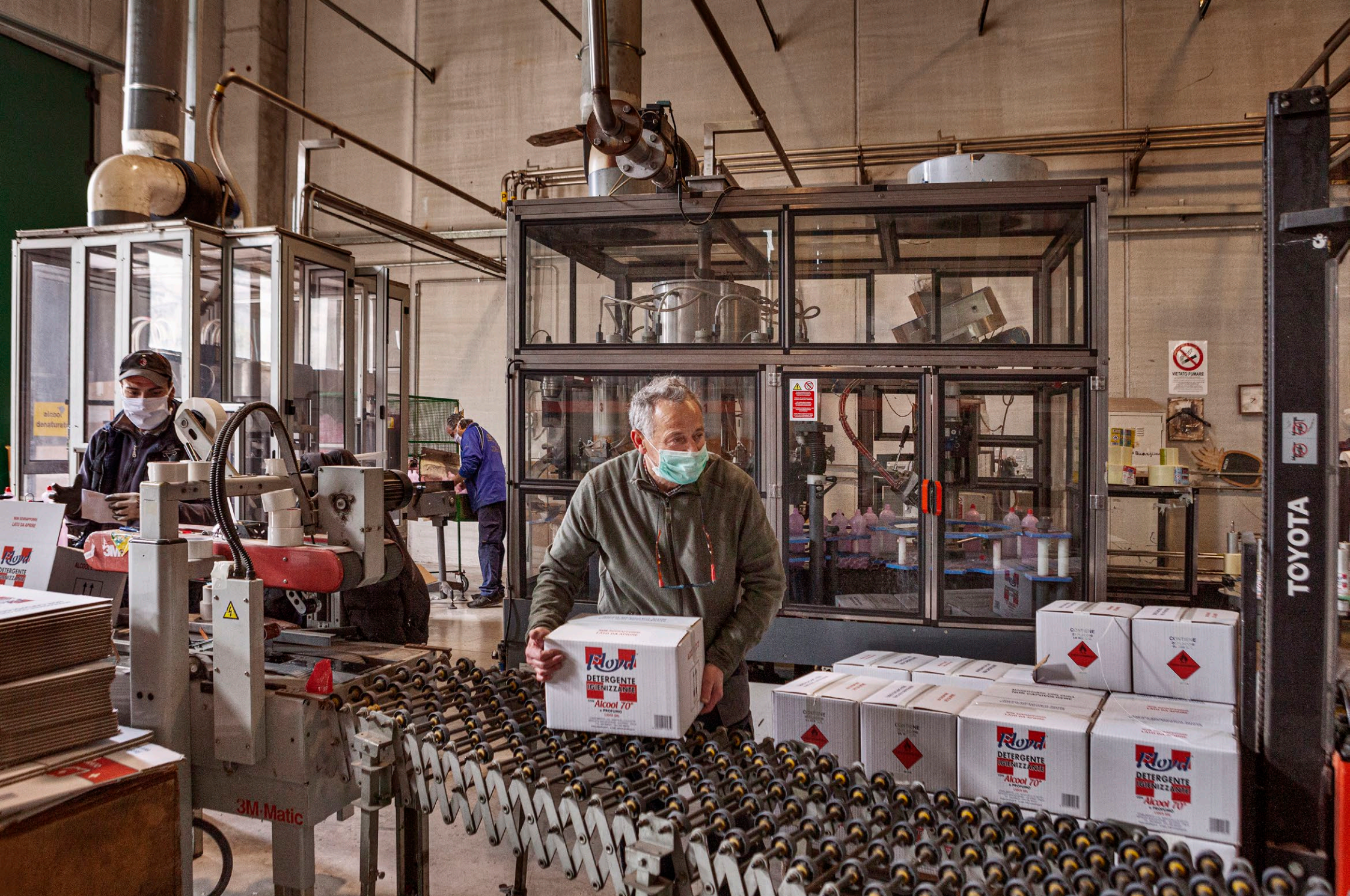
Antica Distilleria Russo, Mercato San Severino (Salerno). Stored cleaning detergent; due to the Covid-19 epidemic, the company has seen demand for distilled spirits collapse, but it has also seen an exponential rise in the demand for denatured alcohol, or processed products such as hand sanitizer. Before, these represented only a small part of the company's production.