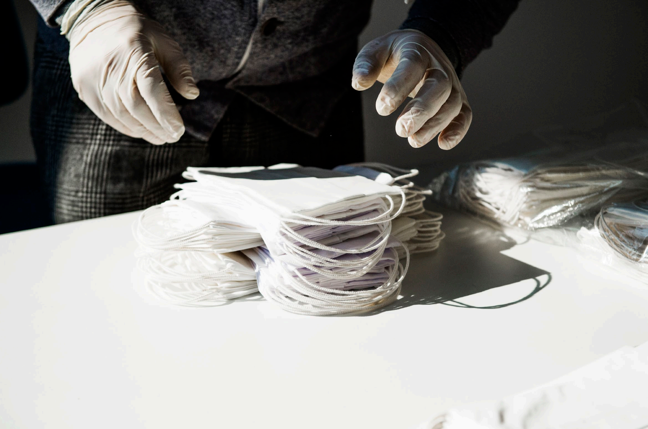
Scataglini Tessuti, Castelfidardo (Ancona). Packaging face masks.