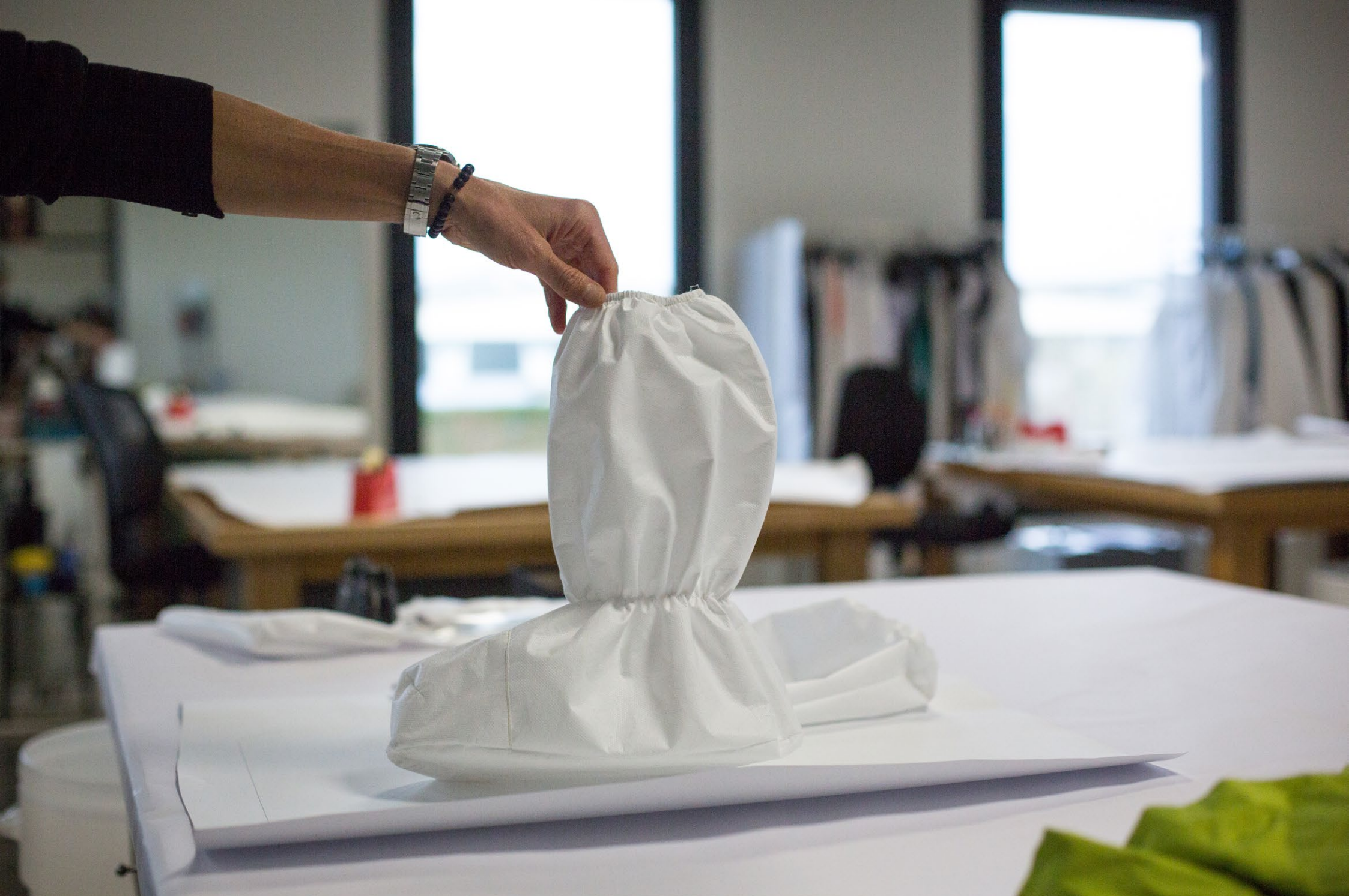
Soncino (Cremona). Cieffe Milano, a company that produces clothing for designer fashion labels, has converted to manufacturing face masks, white coats and protective clothing for doctors in Covid hospitals. A prototype foot covering for use in intensive care units.