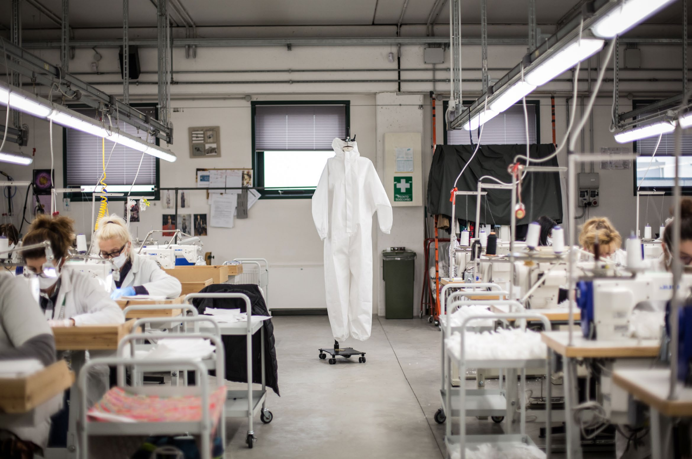
Soncino (Cremona). Cieffe Milano, a company that produces clothing for designer fashion labels, has converted to manufacturing face masks, white coats and protective clothing for doctors in Covid hospitals. The sewing room where the pieces of fabric that arrive from the cutting area are assembled: at the centre is an example of one of the first prototypes of protective suits for workers in intensive care units.