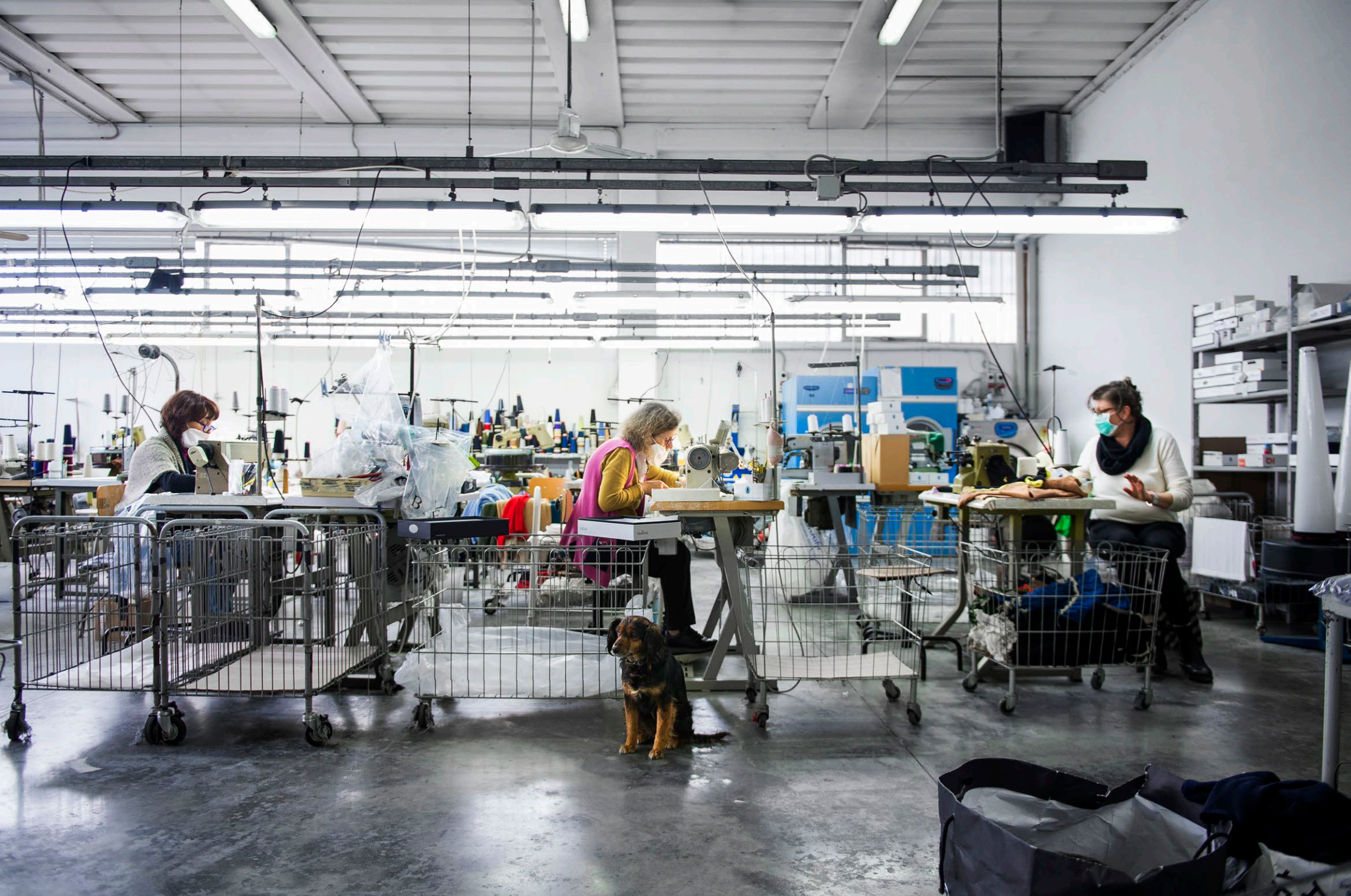
Castelfidardo (Ancona). View of the sewing room at Bafy company, that has been transformed for the production of face masks.