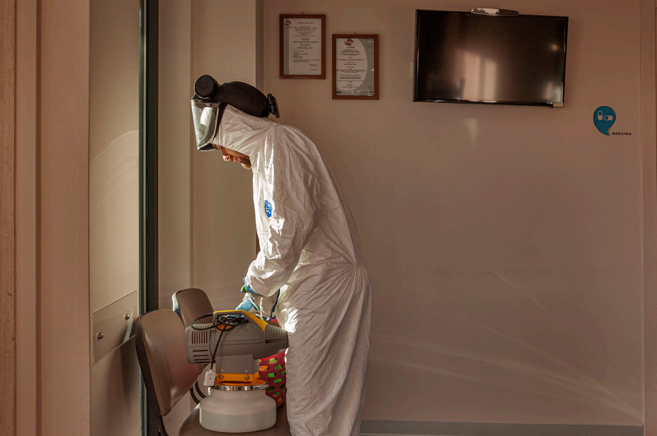
A worker from the company Proverbio Service (Cava De' Tirreni, Salerno) prepares to deep clean a veterinary clinic.