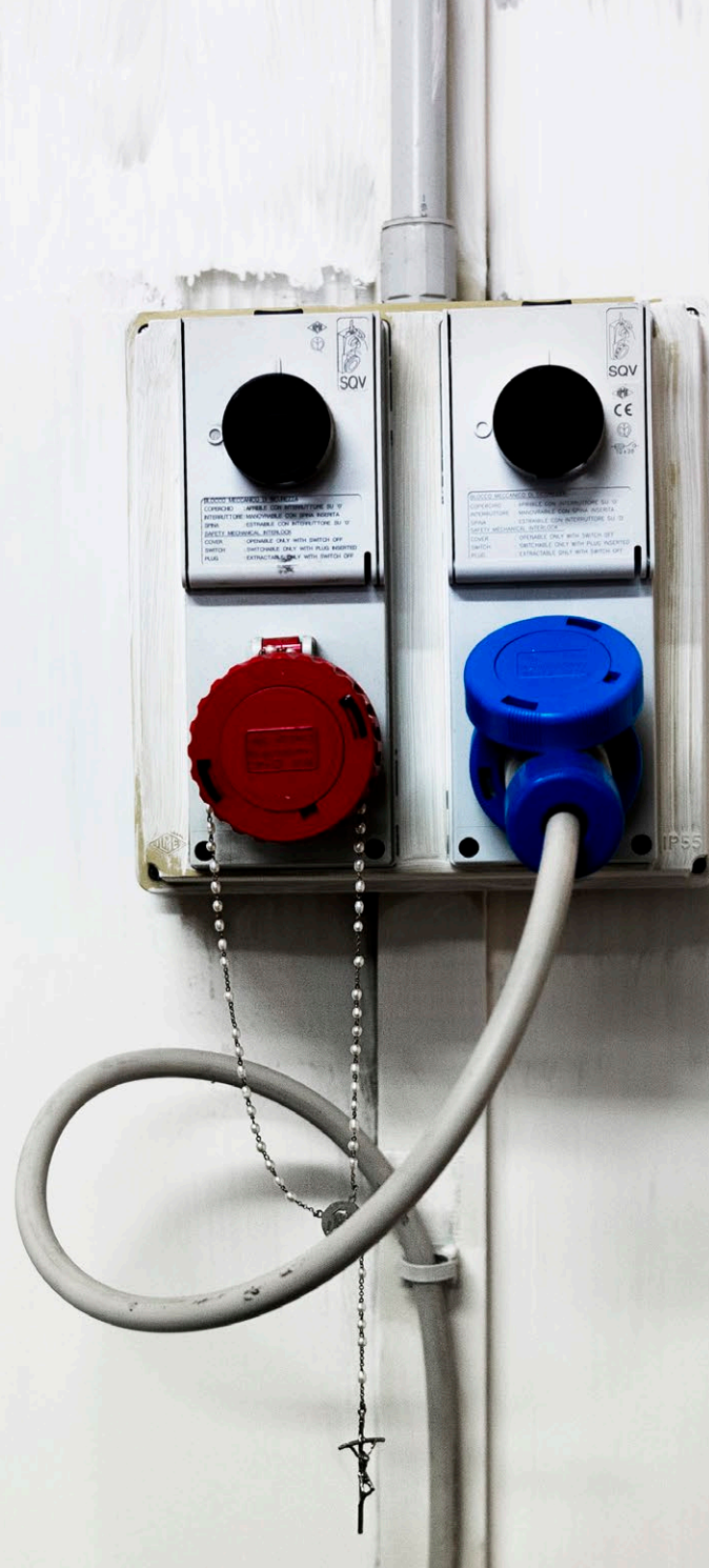
Scataglini Tessuti, Castelfidardo (Ancona). A rosary hangs from an electrical switch on the wall.