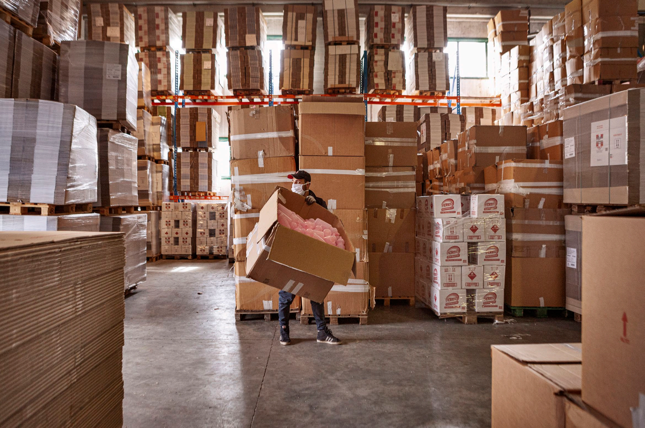
The storeroom of the Antica Distilleria Russo, Mercato San Severino (Salerno). Many workers have been transferred from the production of distilled spirits to the production line for bottling alcohol: in order to meet demand, extra staff have been employed. The factory works 24 hours a day and the storeroom, even though the products are shipped immediately, is always completely full.