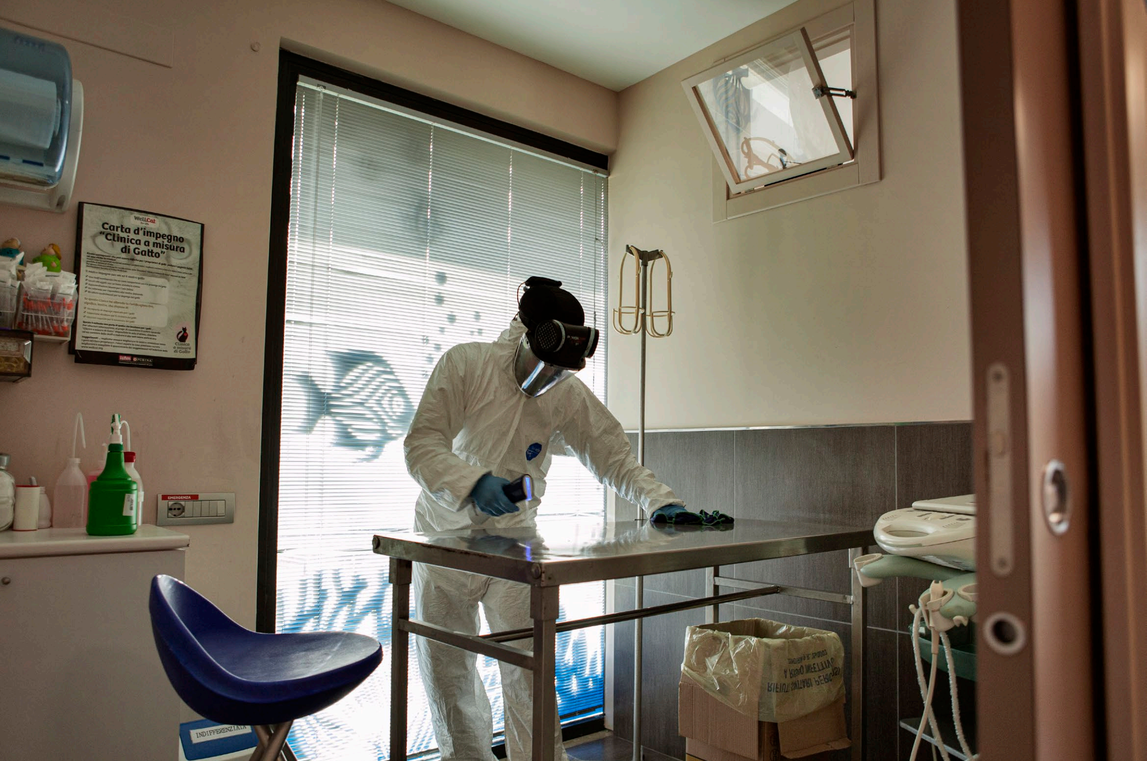
Cava De' Tirreni (Salerno). A worker from the company Proverbio Service deep cleaning a veterinary clinic. The most exposed surfaces are deep cleaned using ozone. One of the problems of the increased frequency of cleaning interventions is that workers are exposed to excessive amounts of bleach and other polluting substances.