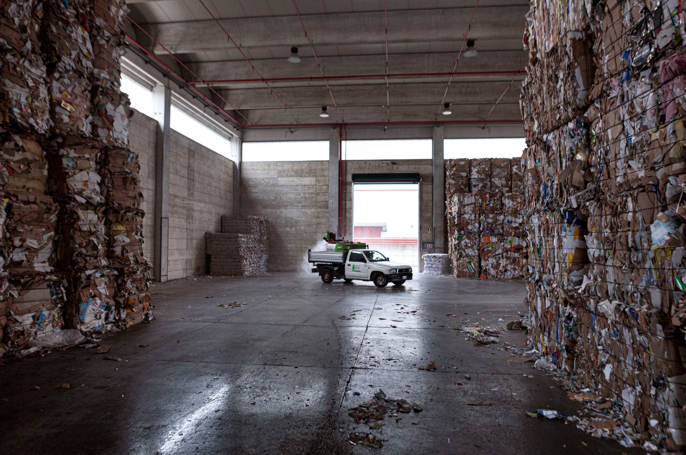
Proverbio Service company (Cava De' Tirreni, Salerno) using bleach to deep clean a large paper-recycling business. At many companies deep cleaning is now taking place more frequently, occurring three times a week instead of just once.