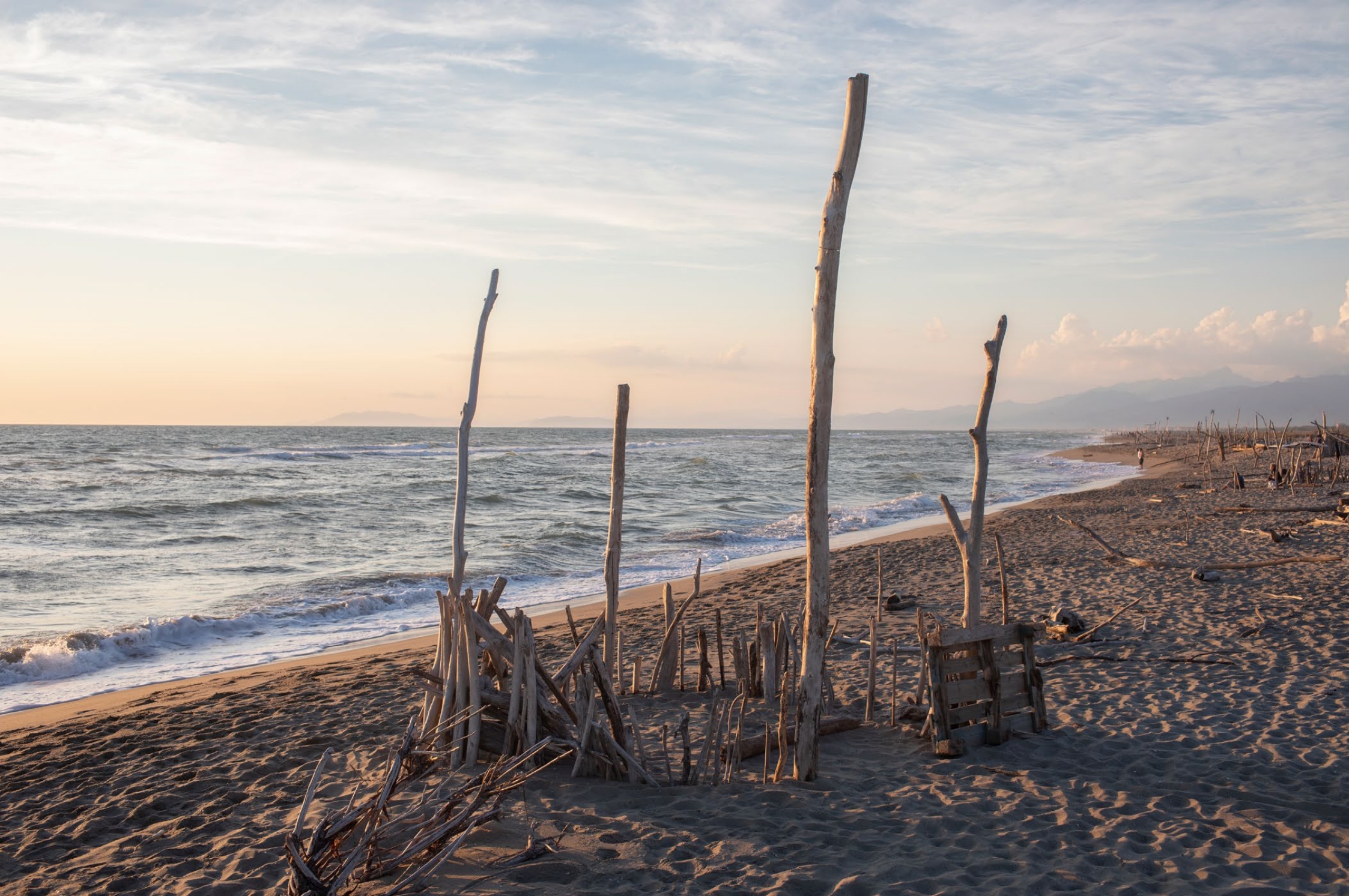
Bocca del Serchio (Pisa). Not far from the estuary of the Serchio River on the Tyrrhenian coast are makeshift beach shelters known locally as "straccali", which are constructed from driftwood. Built and used during the summer by families and groups of friends for hanging out on the beach and sheltering from the sun, they serve as isolated dens from which to enjoy nature. The structures are regularly destroyed by the authorities.