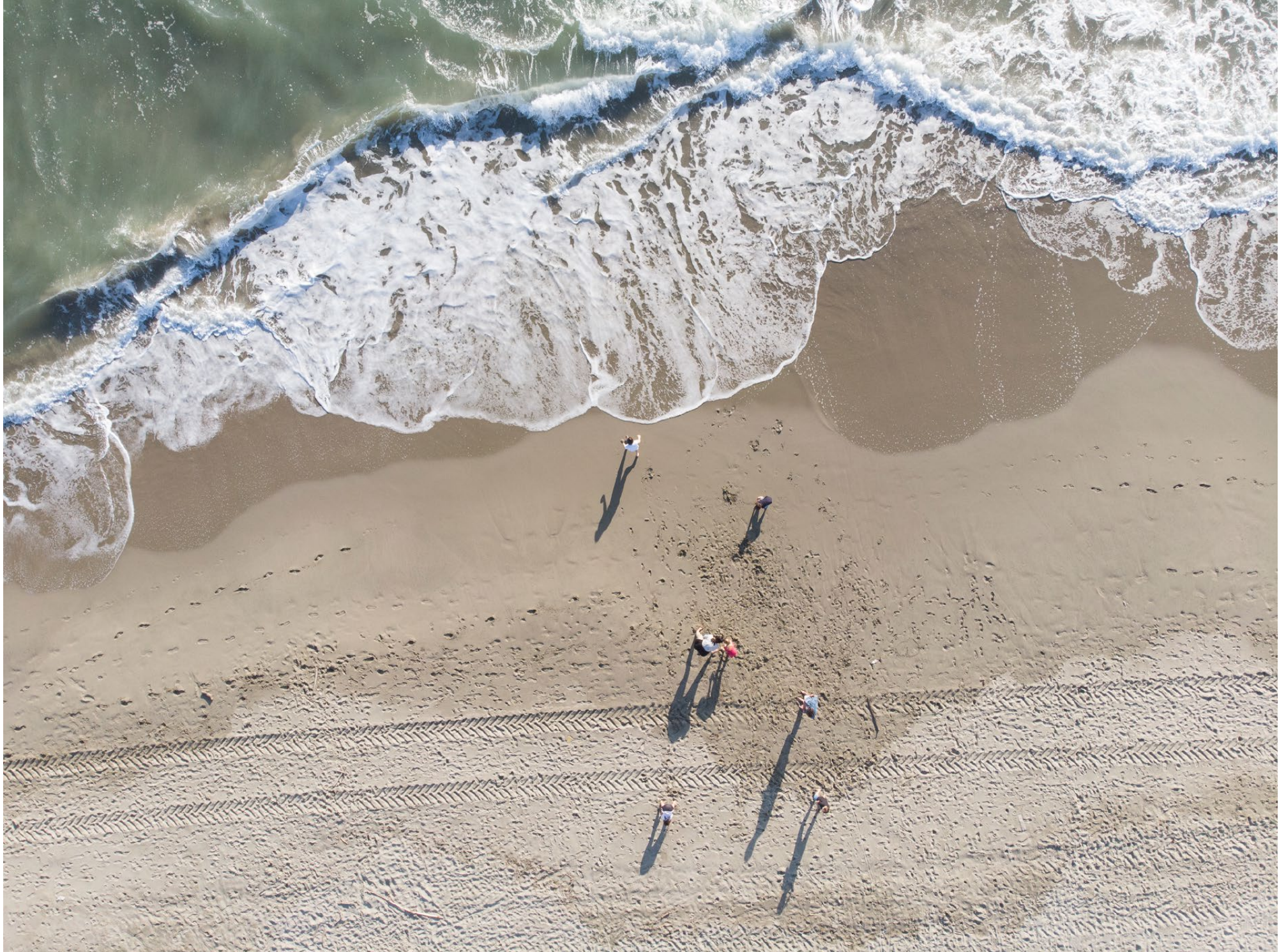
Viareggio (Lucca). A group of children play on the seashore before the beginning of the season when the beach clubs are permitted to prepare the beach with umbrellas and sunbeds.