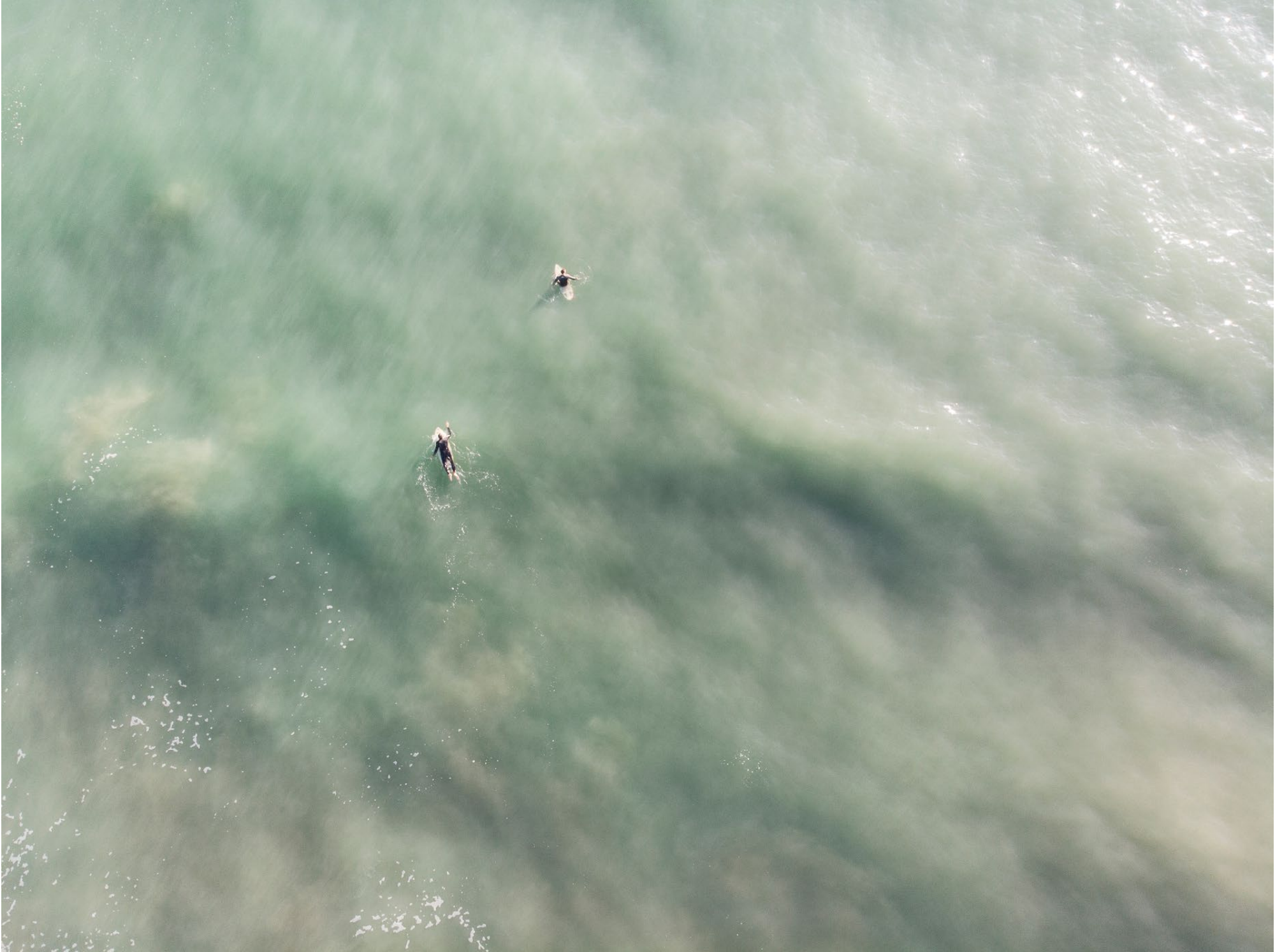
Viareggio (Lucca). Two surfers paddle out into the surf. Among the few activities permitted under the emergency lockdown decree is the practice of individual open-air sports.