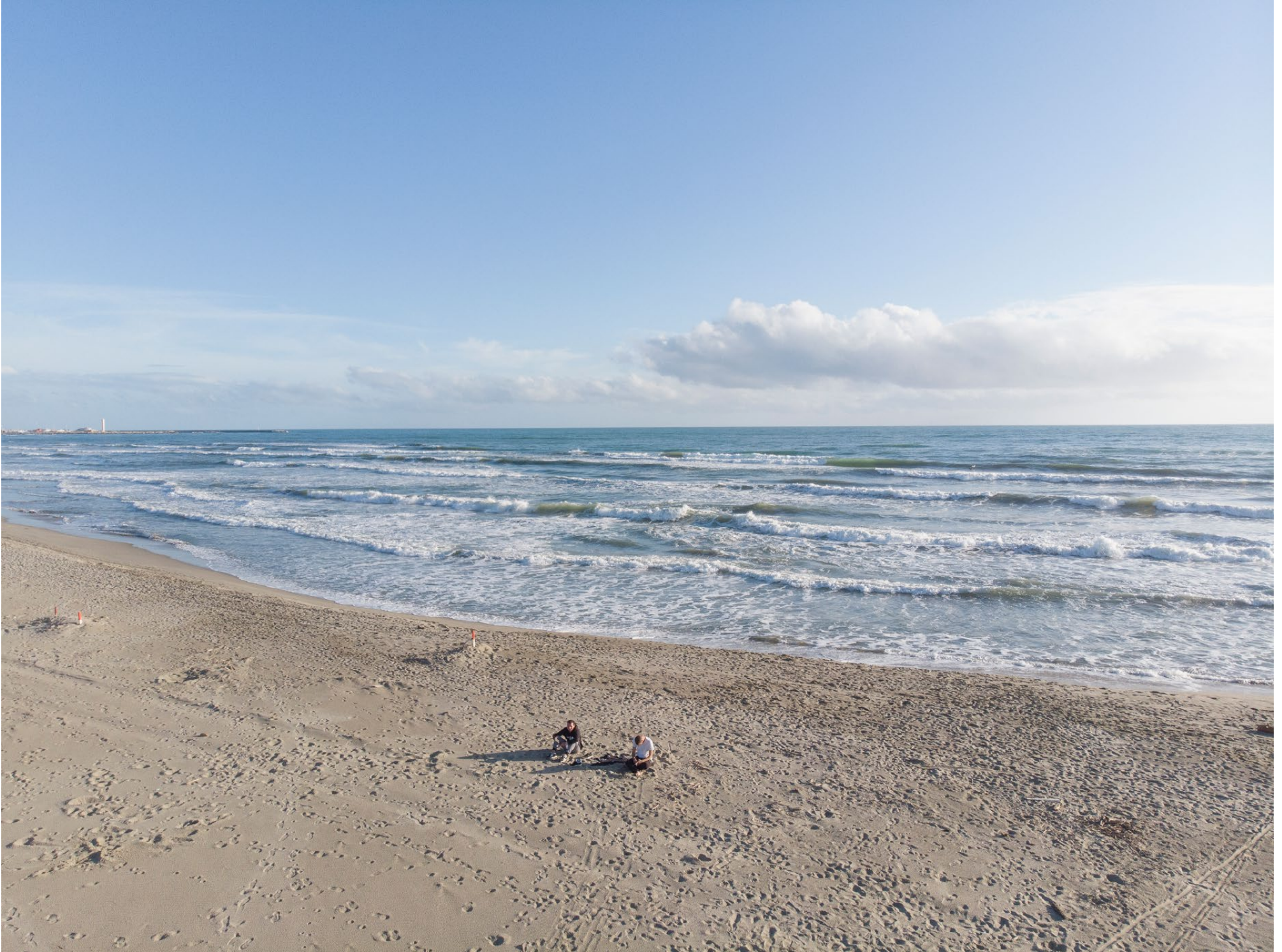
Viareggio (Lucca). Two men sit socially distanced on the shoreline, before the season begins and the beach clubs open and lay out their umbrellas and sunbeds.