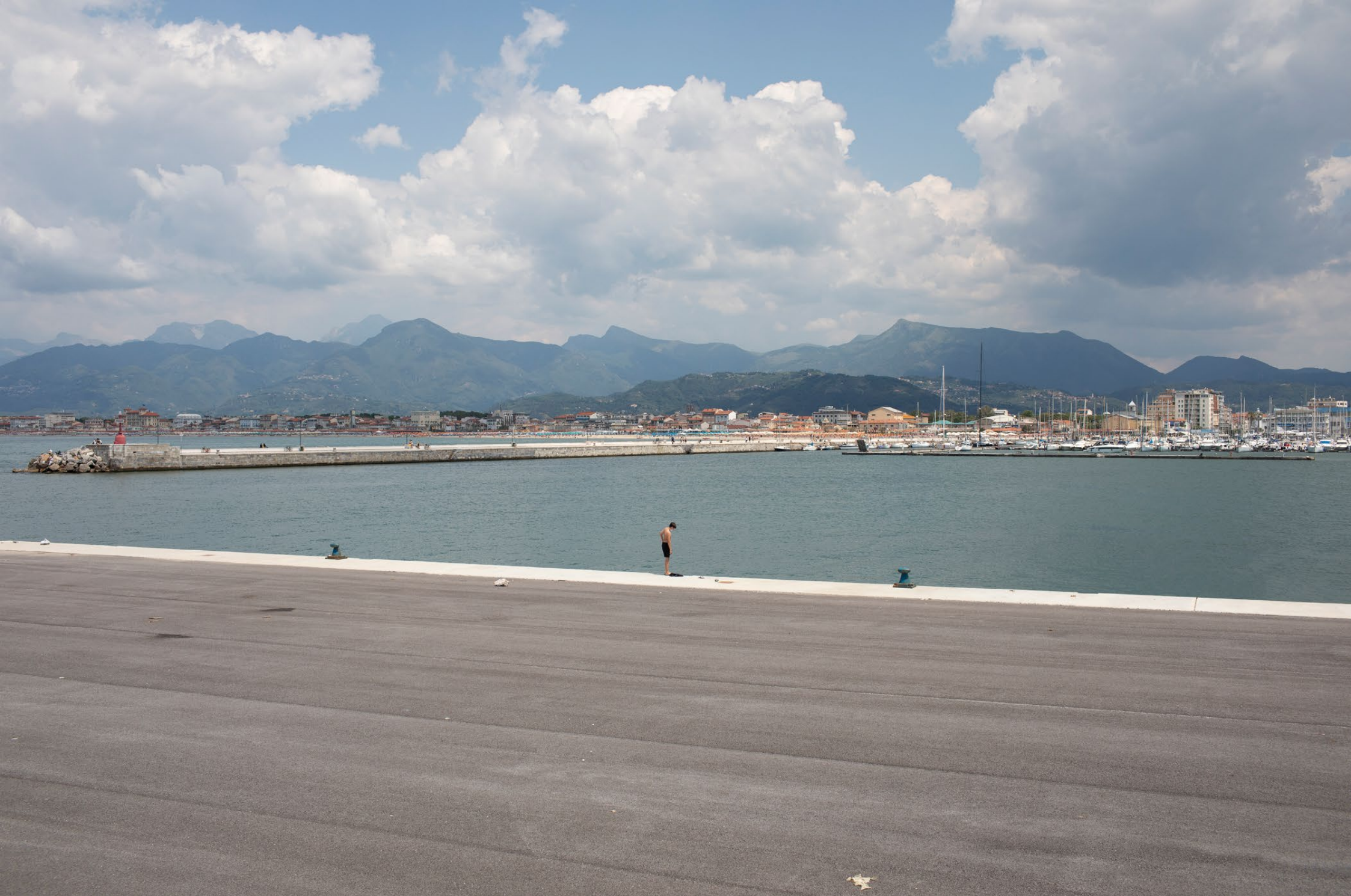
Viareggio (Lucca). A young man looks for the right place to dive down to gather mussels from the submerged rocks.