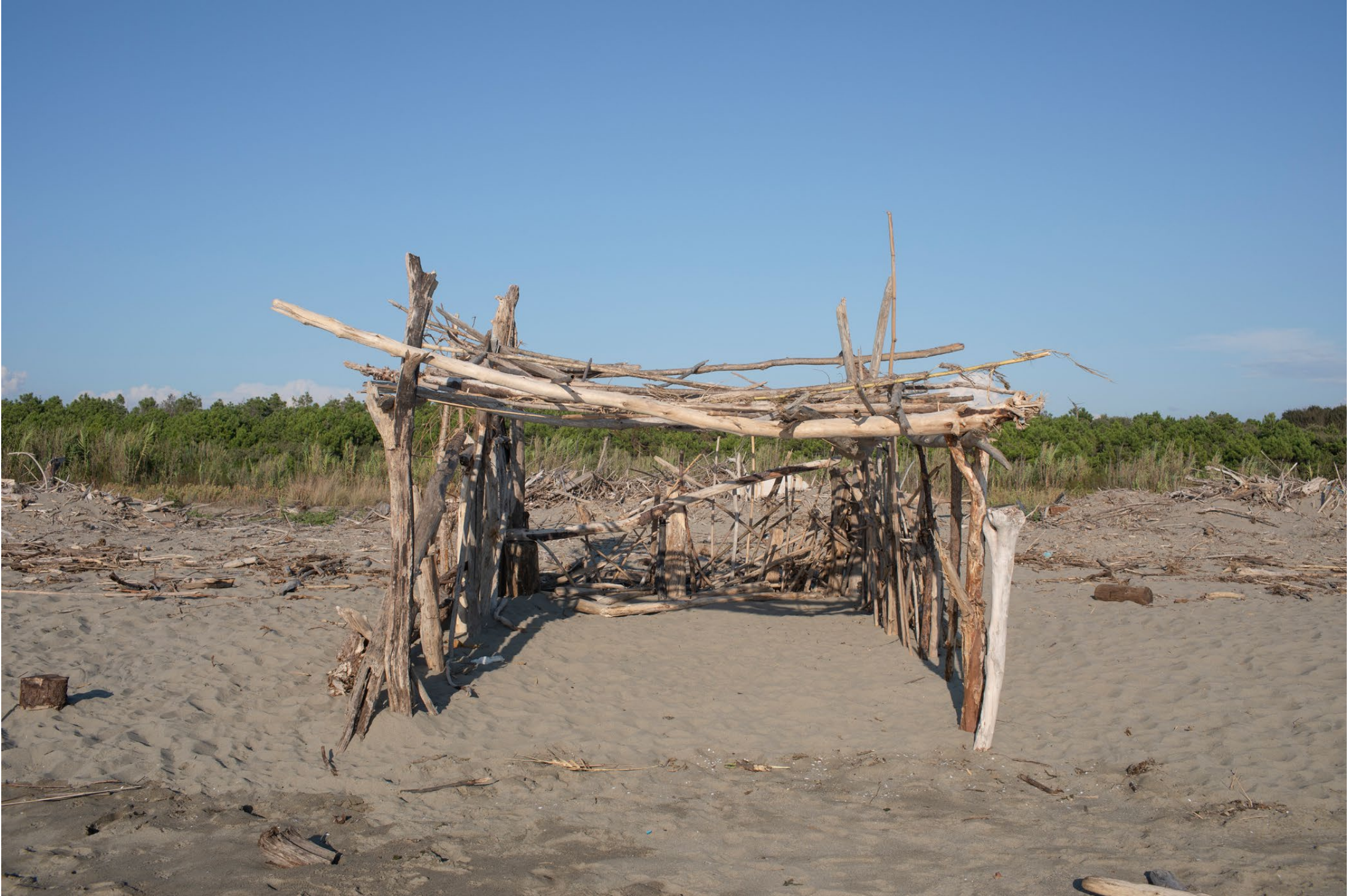
Bocca del Serchio (Pisa). Not far from the estuary of the Serchio River on the Tyrrhenian coast are makeshift beach shelters known locally as "straccali", which are constructed from driftwood. Built and used during the summer by families and groups of friends for hanging out on the beach and sheltering from the sun, they serve as isolated dens from which to enjoy nature. The structures are regularly destroyed by the authorities.