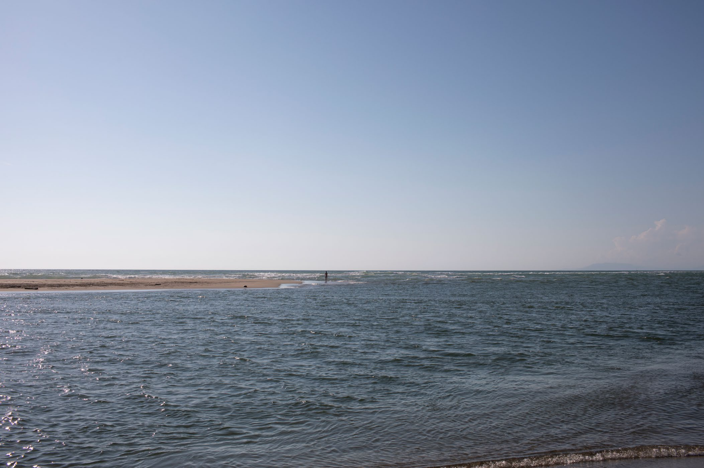
Bocca del Serchio (Pisa). A young woman walks alone near the estuary of the Serchio River on the Tyrrhenian Sea.