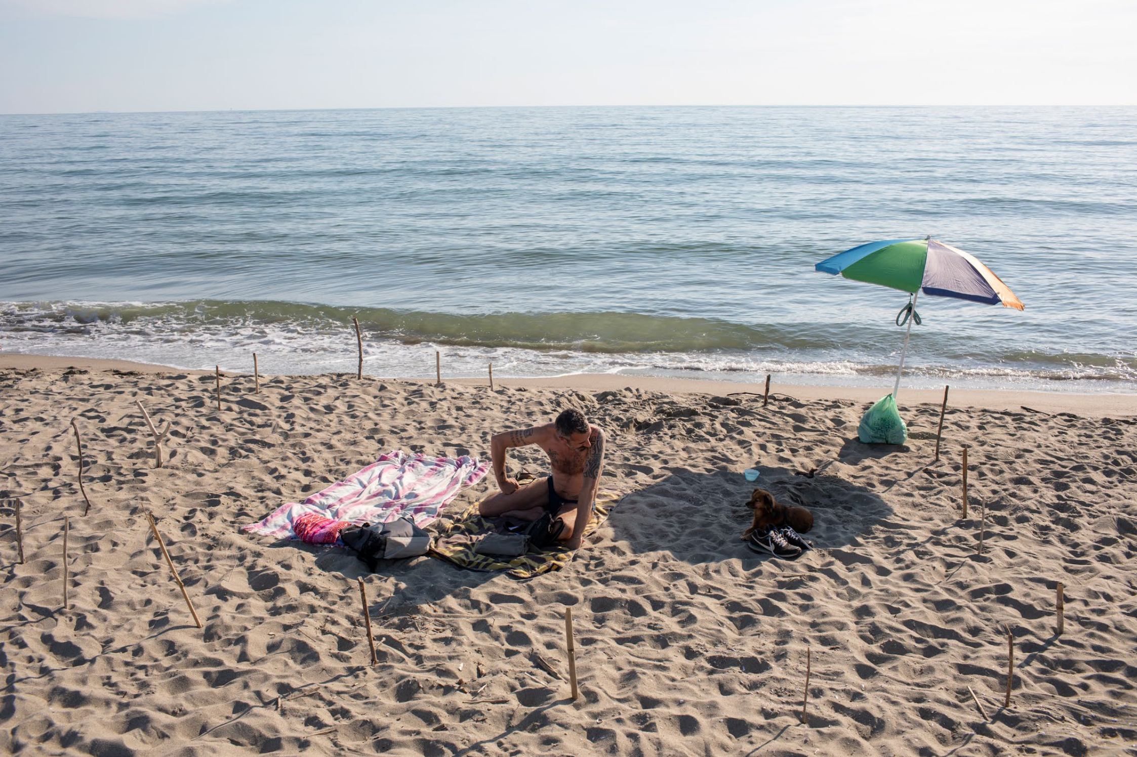
Viareggio (Lucca). At the public beach area called Lecciona inside the Migliarino-San Rossore Nature Reserve, a man relaxes with his dog in an area he has cordoned off with sticks in the sand in order to protect his personal space.