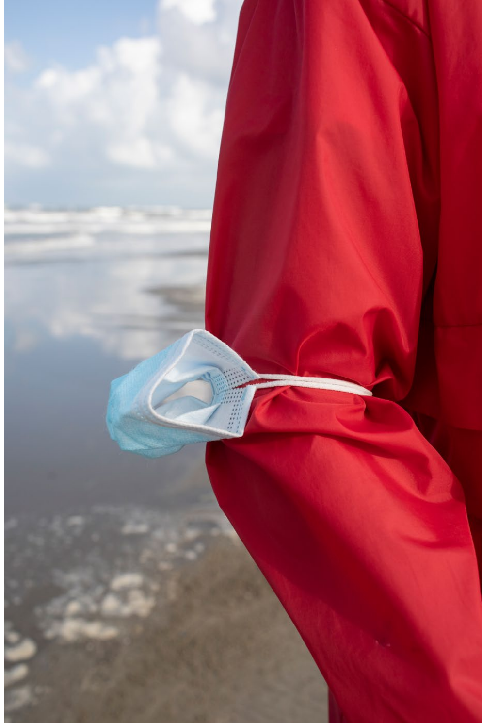
Viareggio (Lucca). A lifeguard keeps his anti-Covid mask on his elbow when he is not in the vicinity of other people.