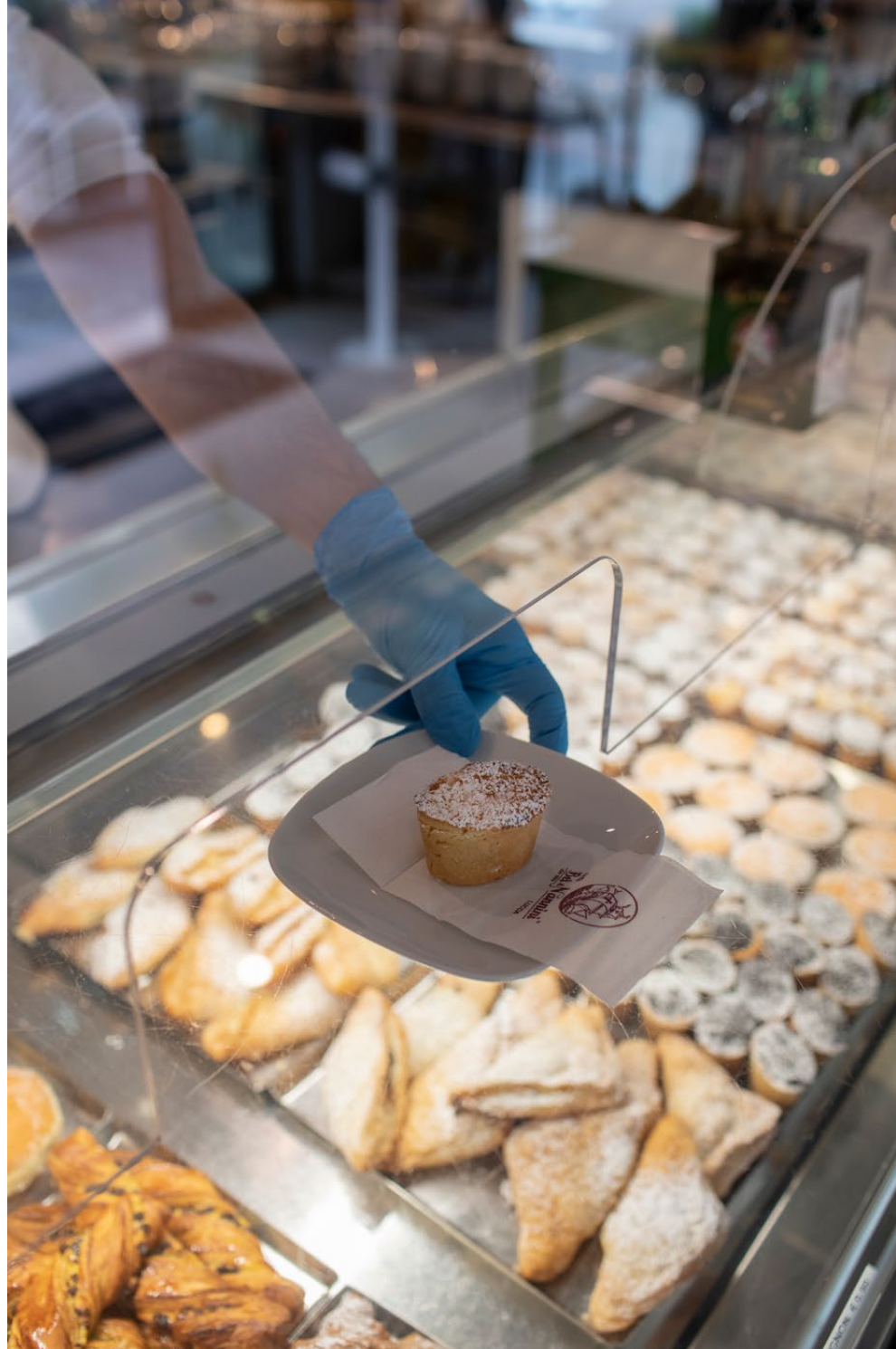
Viareggio (Lucca). A barman at the Galliano bar, one of the most well known on the seafront, serves a pastry treat.