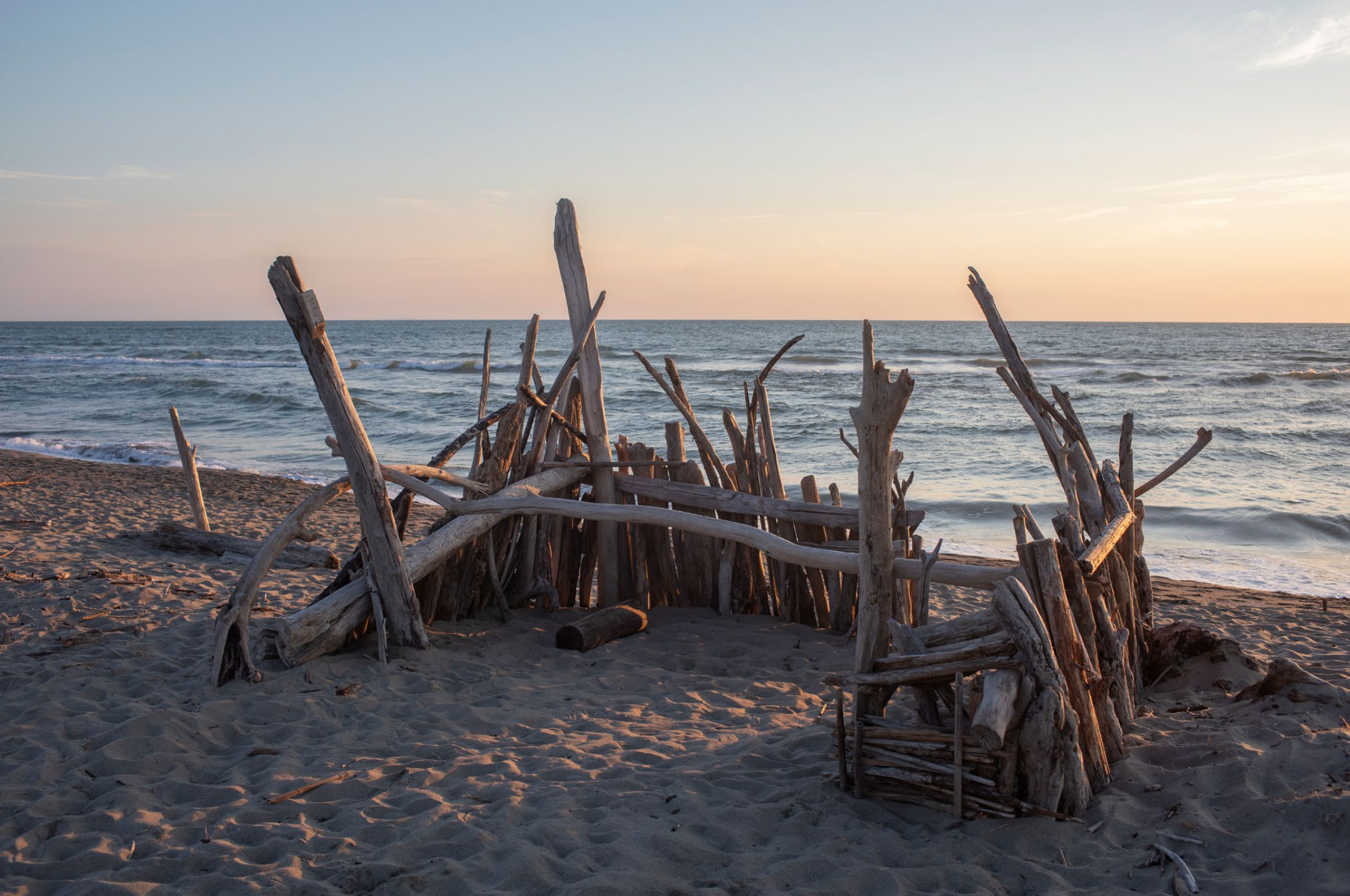
Bocca del Serchio (Pisa). Not far from the estuary of the Serchio River on the Tyrrhenian coast are makeshift beach shelters known locally as "straccali", which are constructed from driftwood. Built and used during the summer by families and groups of friends for hanging out on the beach and sheltering from the sun, they serve as isolated dens from which to enjoy nature. The structures are regularly destroyed by the authorities.