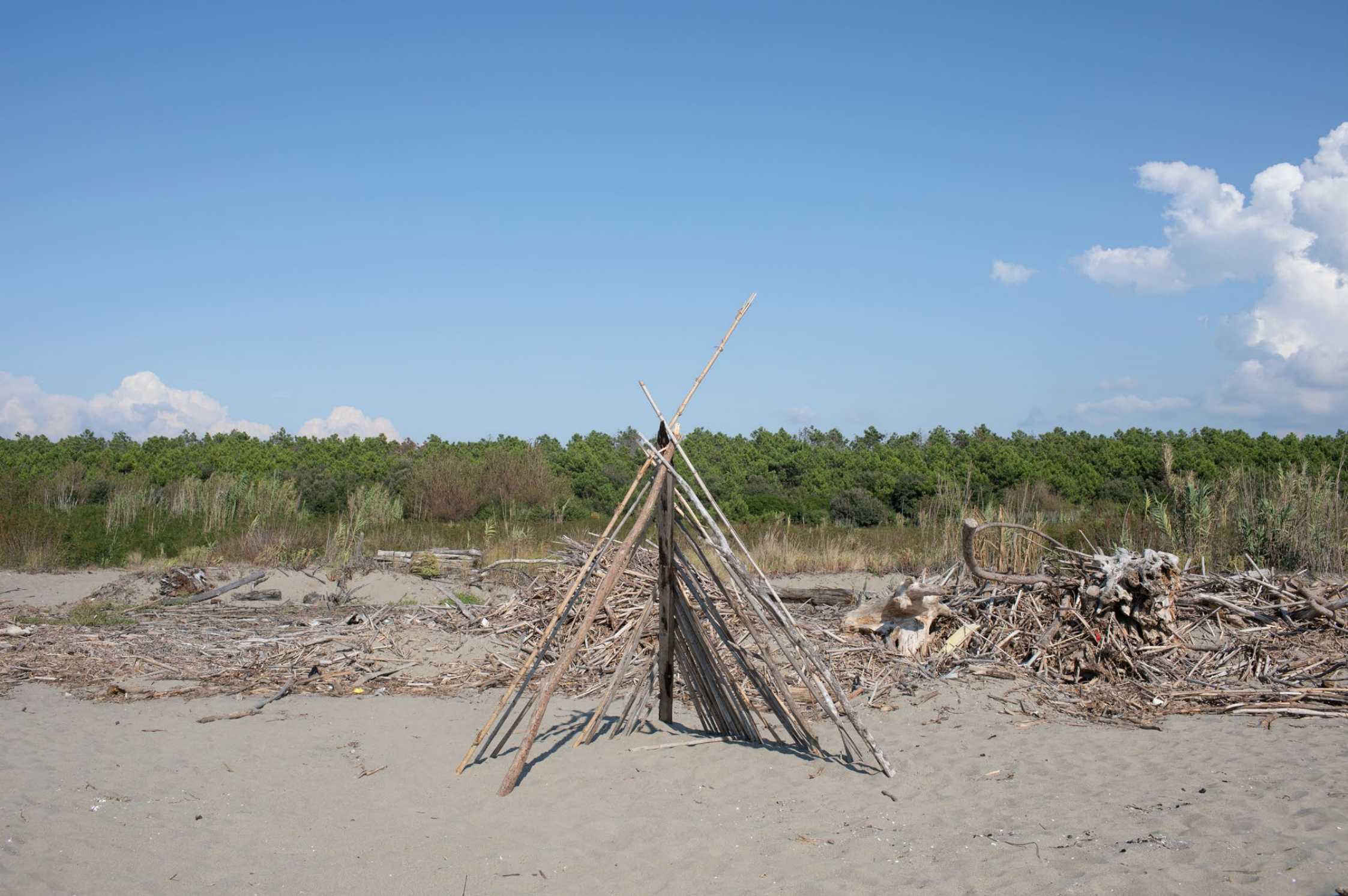
Bocca del Serchio (Pisa). Not far from the estuary of the Serchio River on the Tyrrhenian coast are makeshift beach shelters known locally as "straccali", which are constructed from driftwood. Built and used during the summer by families and groups of friends for hanging out on the beach and sheltering from the sun, they serve as isolated dens from which to enjoy nature. The structures are regularly destroyed by the authorities.