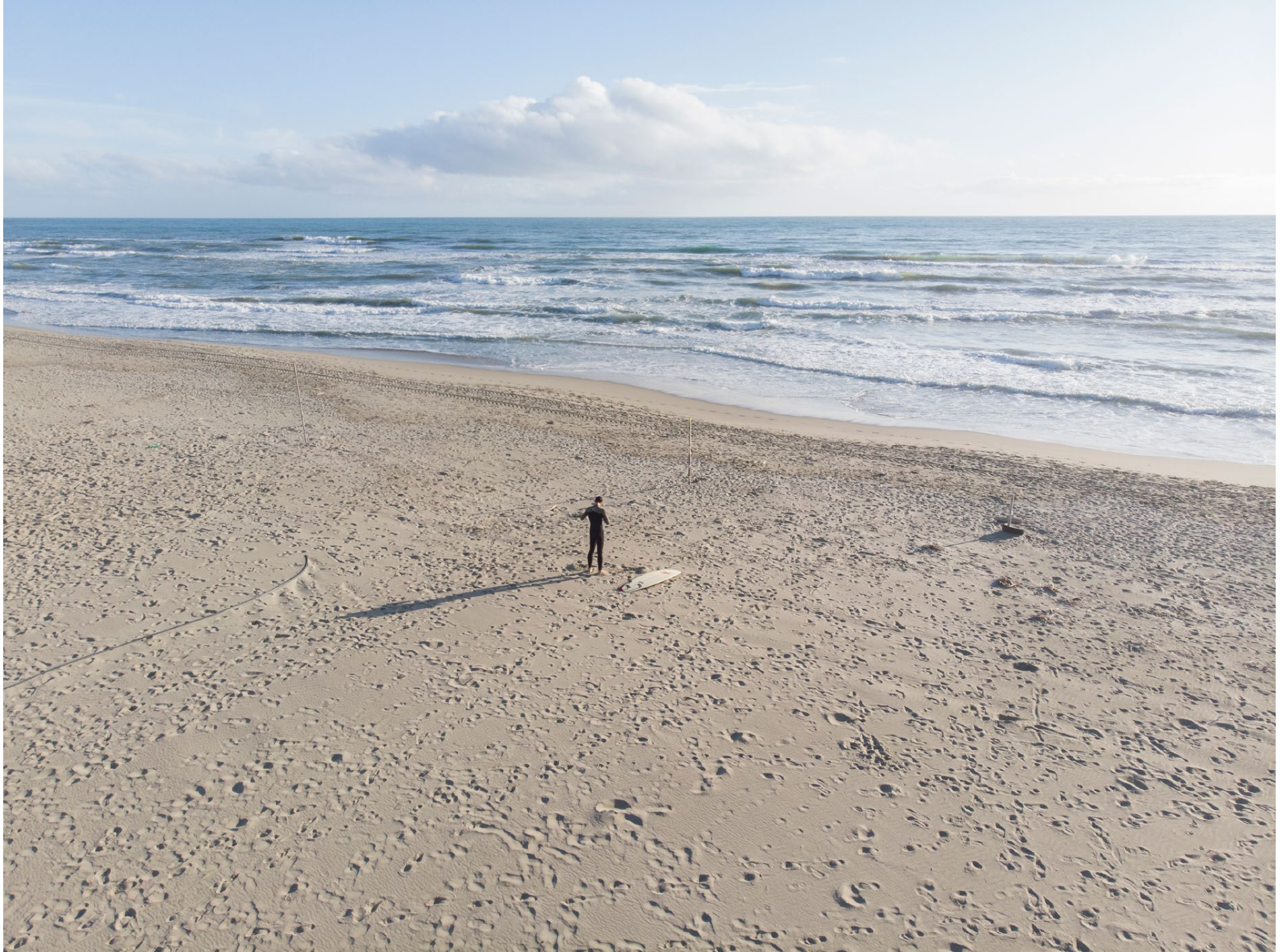
Viareggio (Lucca). A surfer zips up his wetsuit before heading out into the water. Among the few activities allowed under the emergency lockdown decrees is the practice of individual outdoor sports.