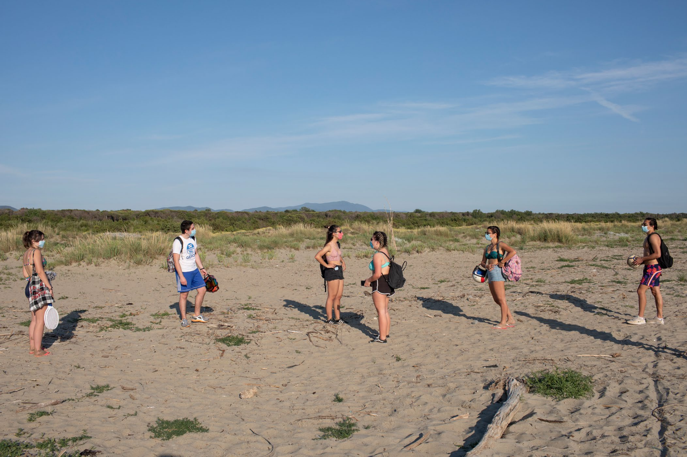
Viareggio (Lucca). The public beach area known as Lecciona inside the Migliarino-San Rossore Nature Reserve. A group of youngsters are socially distanced in order to prevent the spread of Covid-19.