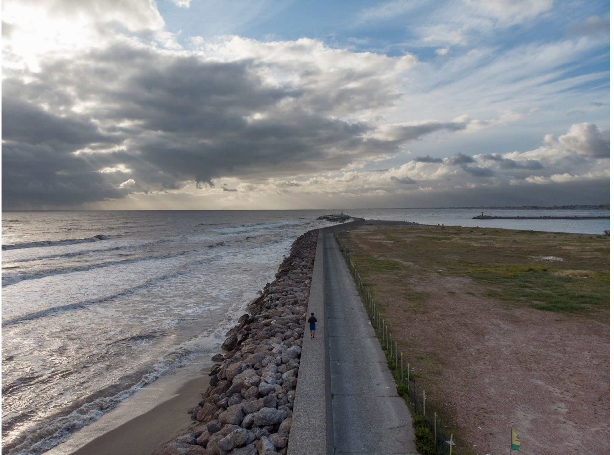
Viareggio (Lucca). The mouth of the port. A young man walks alone at dusk alongside the so-called Muraglione, the sea wall.