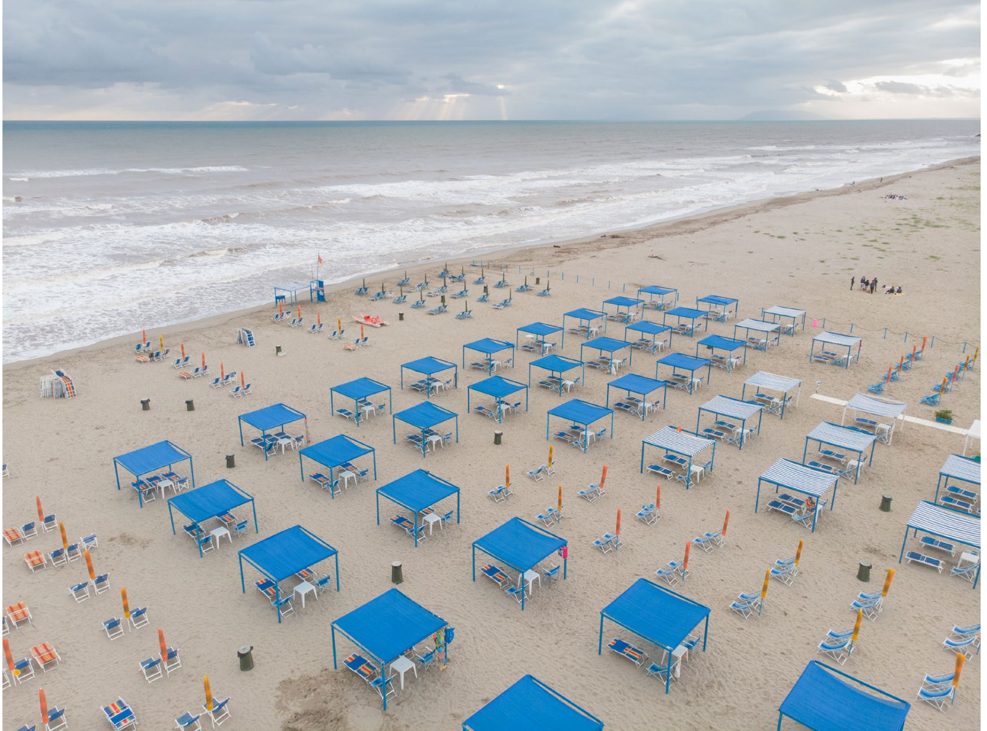
Viareggio (Lucca). An aerial view of the Darsena beach. Sunshades and umbrellas, according to last summer's emergency decree, must be positioned in such a way as to ensure each one has 10 square metres of free space around it.