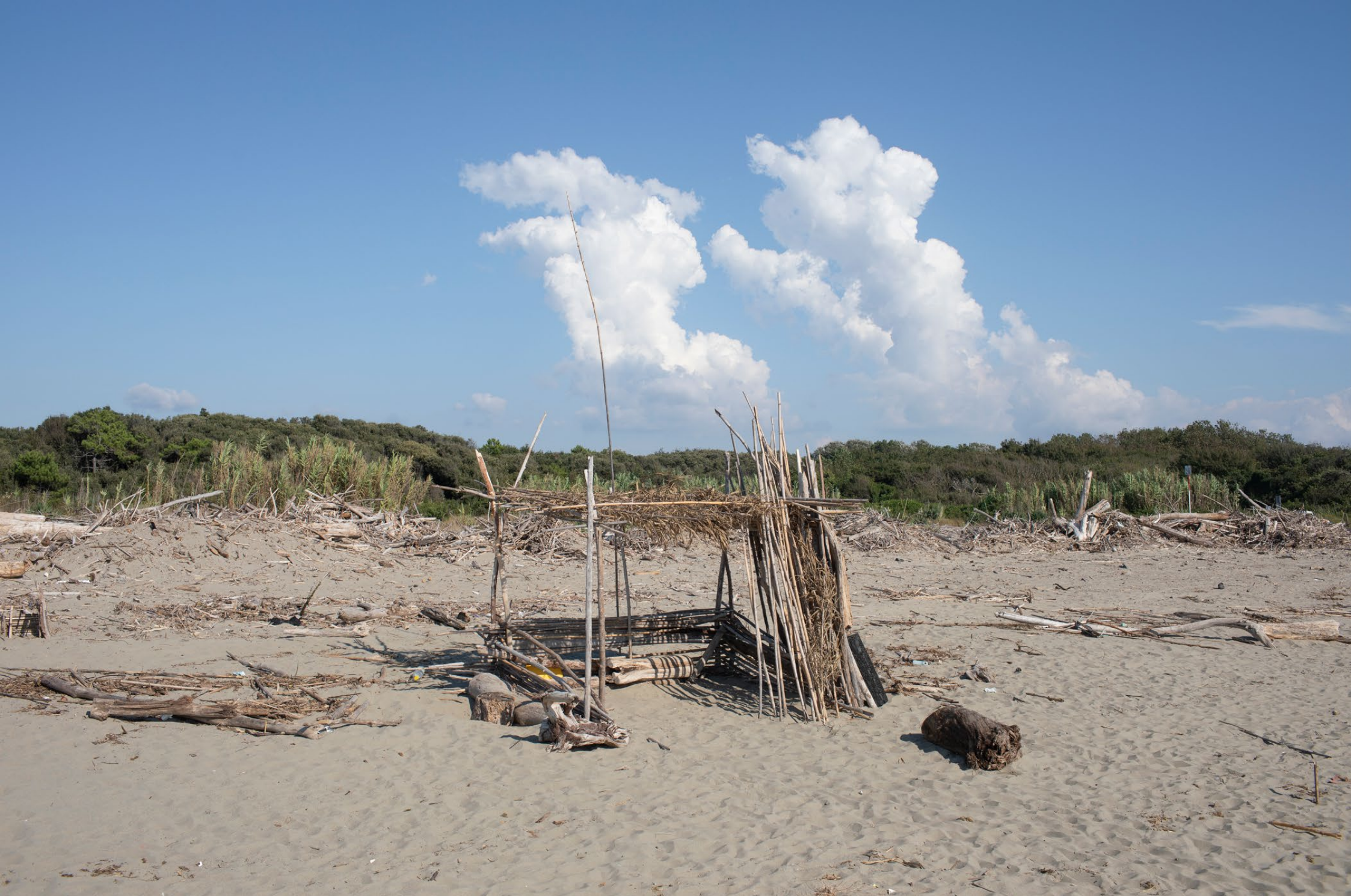
Bocca del Serchio (Pisa). Not far from the estuary of the Serchio River on the Tyrrhenian coast are makeshift beach shelters known locally as "straccali", which are constructed from driftwood. Built and used during the summer by families and groups of friends for hanging out on the beach and sheltering from the sun, they serve as isolated dens from which to enjoy nature. The structures are regularly destroyed by the authorities.