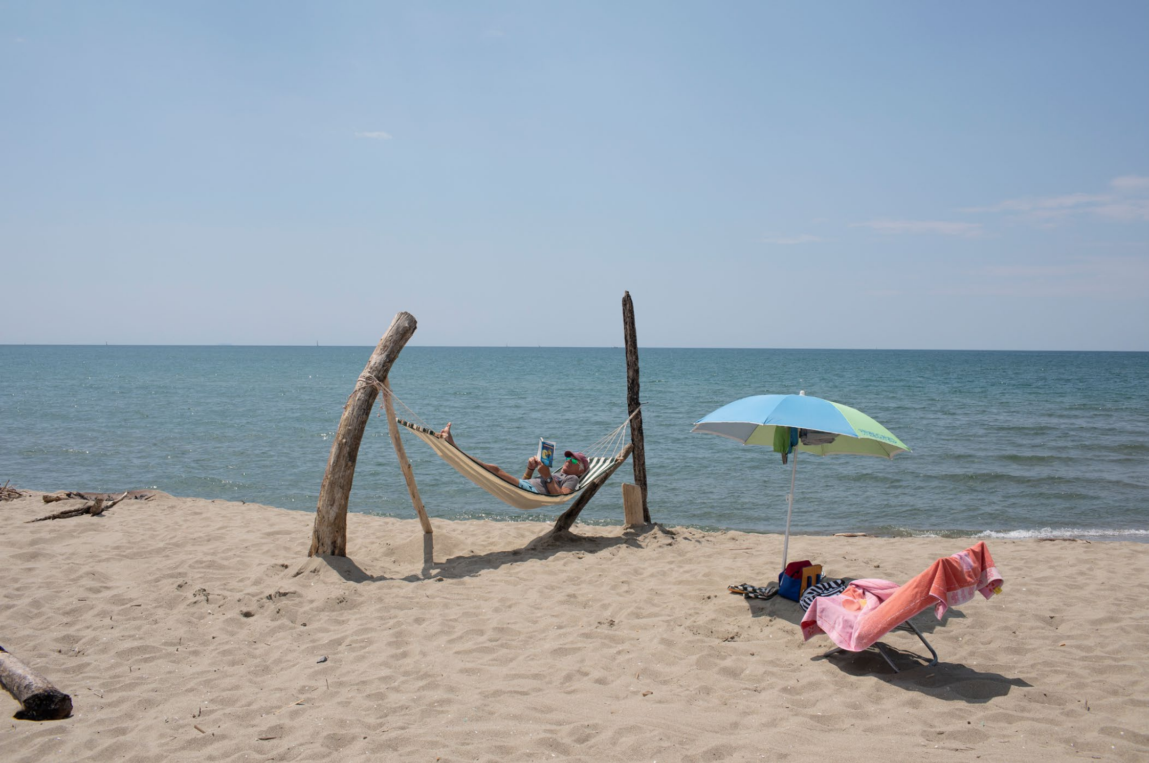
Viareggio (Lucca). Aldo, aged 63, reads a book while relaxing in a hammock strung between two driftwood logs on the public beach alongside the so-called Muraglione sea wall.