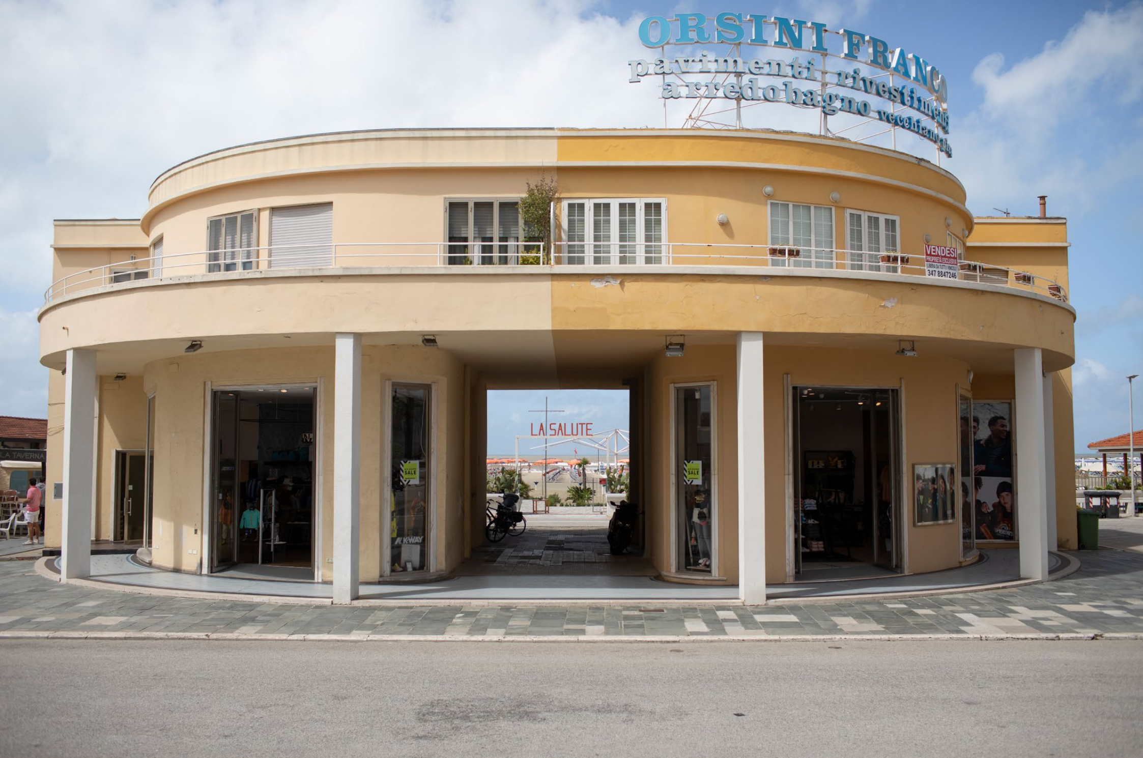
Viareggio (Lucca). The historic entrance to La Salute beach club on the seafront.