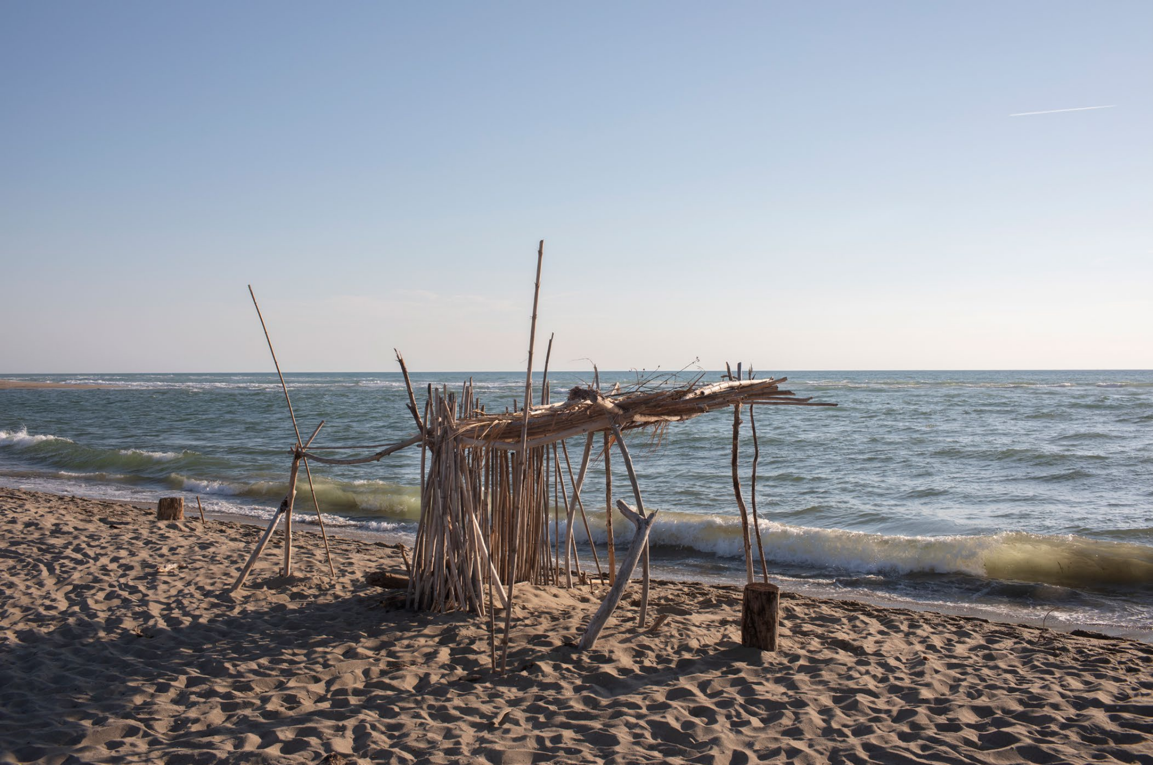
Viareggio (Lucca). At the public beach area known as Lecciona inside the Migliarino-San Rossore Nature Reserve are makeshift beach shelters known locally as "straccali", which are constructed from driftwood. Built and used during the summer by families and groups of friends for hanging out on the beach and sheltering from the sun, they serve as isolated dens from which to enjoy nature. The structures are regularly destroyed by the authorities.