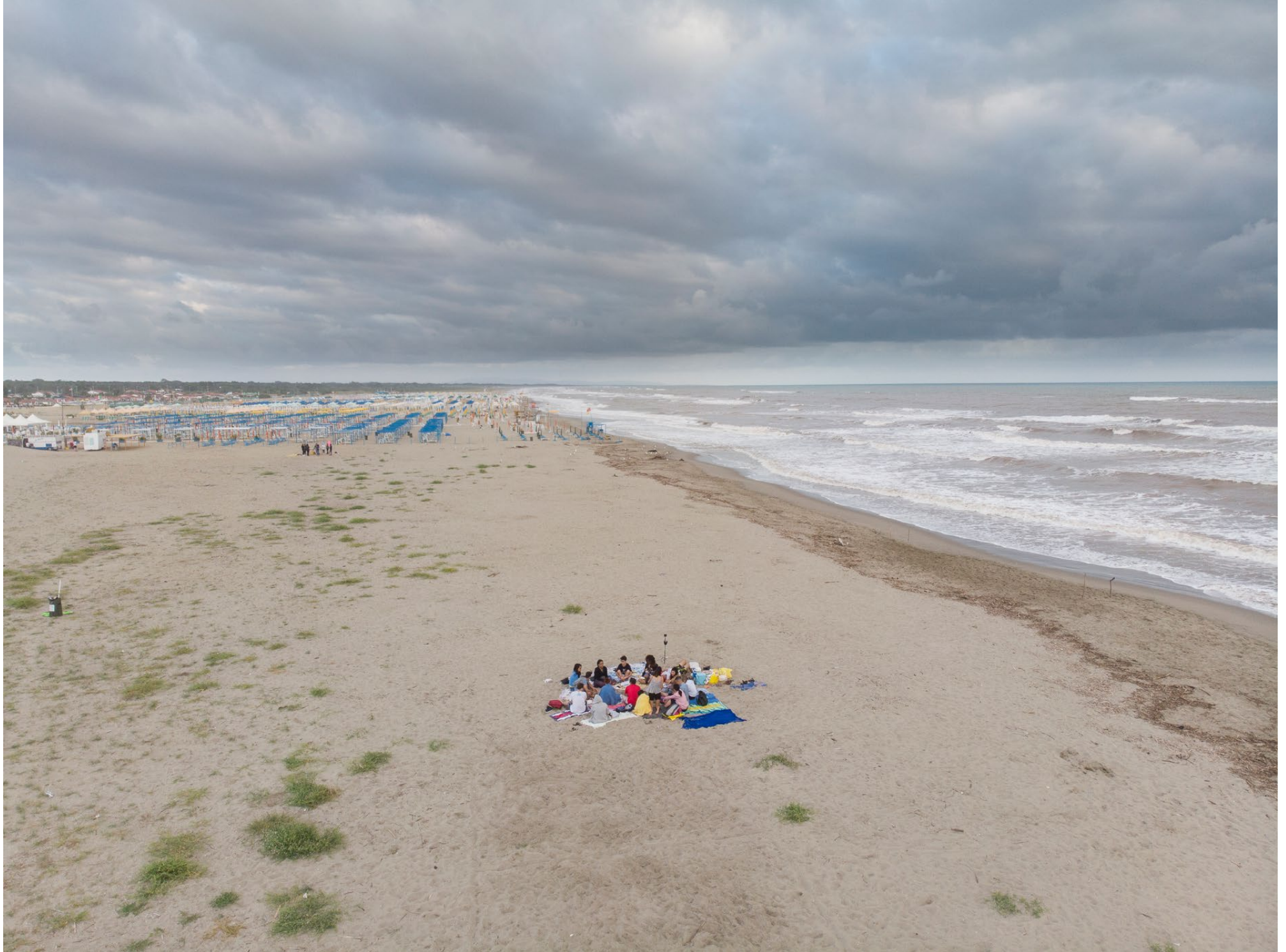
Viareggio (Lucca). The mouth of the port. A group of youngsters on the public beach alongside the Muraglione sea wall.