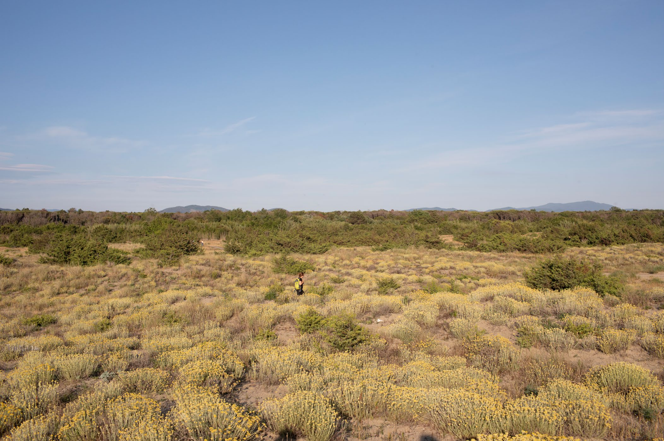
Viareggio (Lucca). A young woman walks along a path between the "camuciolo", in the area of the public beach called Lecciona. "Camuciolo" is the local name for Helichrysum stoechas , a wild plant that grows on the dunes.