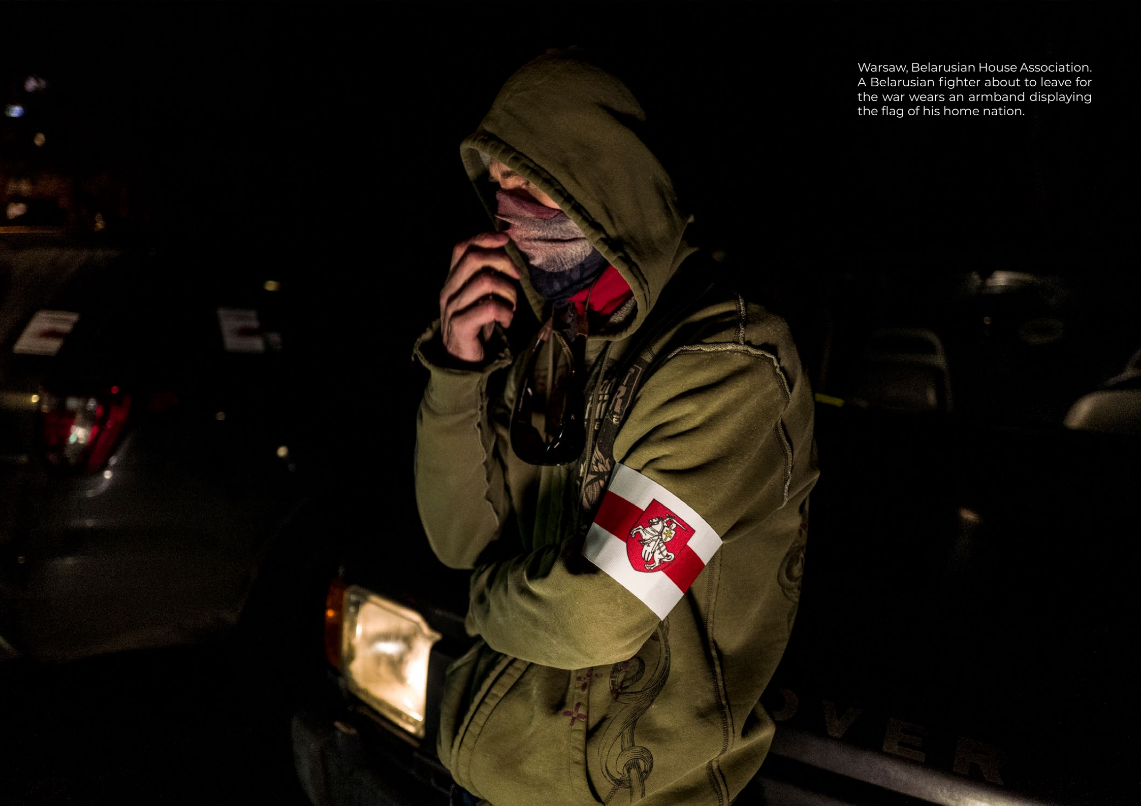
Warsaw, Belarusian House Association. A Belarusian fighter about to leave for the war wears an armband displaying the flag of his home nation.