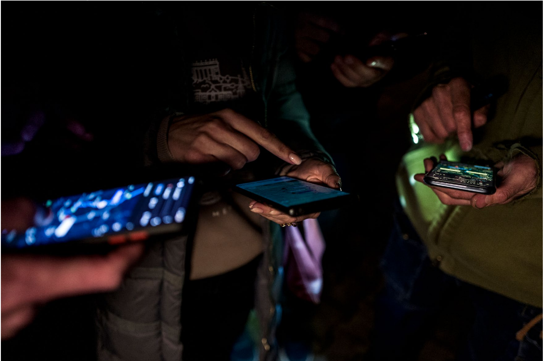
Warsaw, Belarusian House Association. Just before their departure the fighters finalize the details of the mission and communicate via Telegram with their contacts in Ukraine.