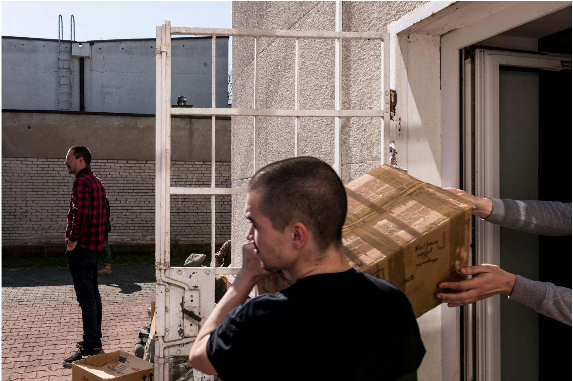
Belarusian fighters prepare to go to war. In the Belarusian House in Warsaw, they stock up on food and basic necessities to take with them when they cross the border.