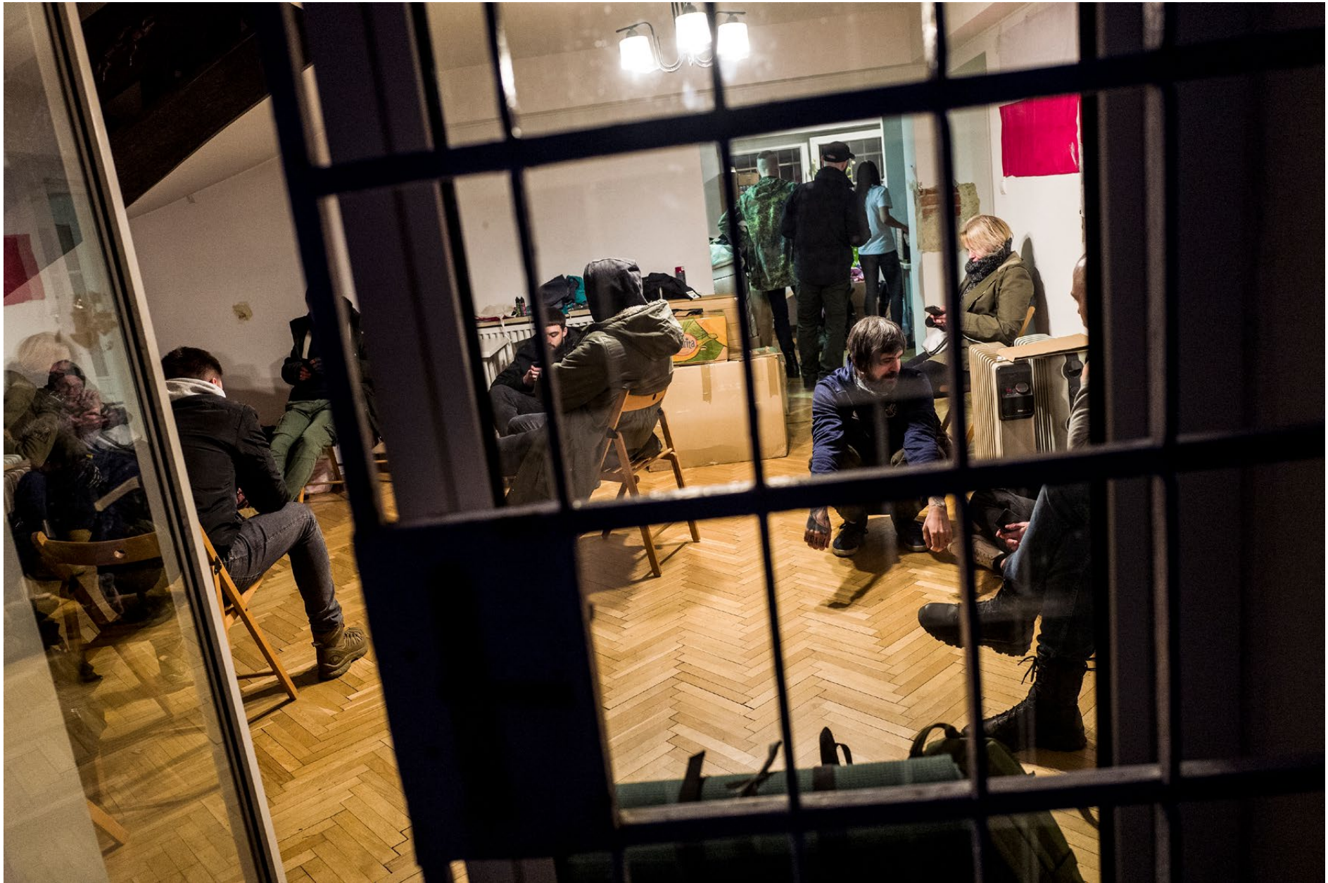
Warsaw, Belarusian House Association. After having dinner, the Belarusian fighters await instructions about the time of their departure. They will arrive early in the morning in Medyka, the last city in Poland, before crossing the border into Ukraine.