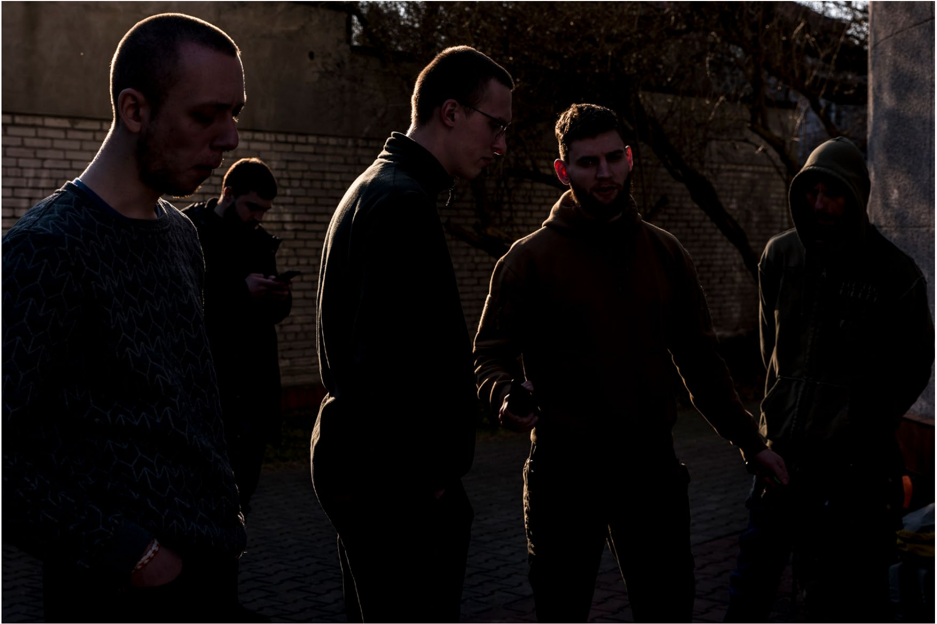
Warsaw. Fifteen Belarusian youngsters are set to cross the border that night to fight against the Russian invasion. They have only known each other for a few hours. They initially made contact via a Telegram channel and met in the Belarusian House in Warsaw, a hub for the Belarusian expatriate community in Poland.