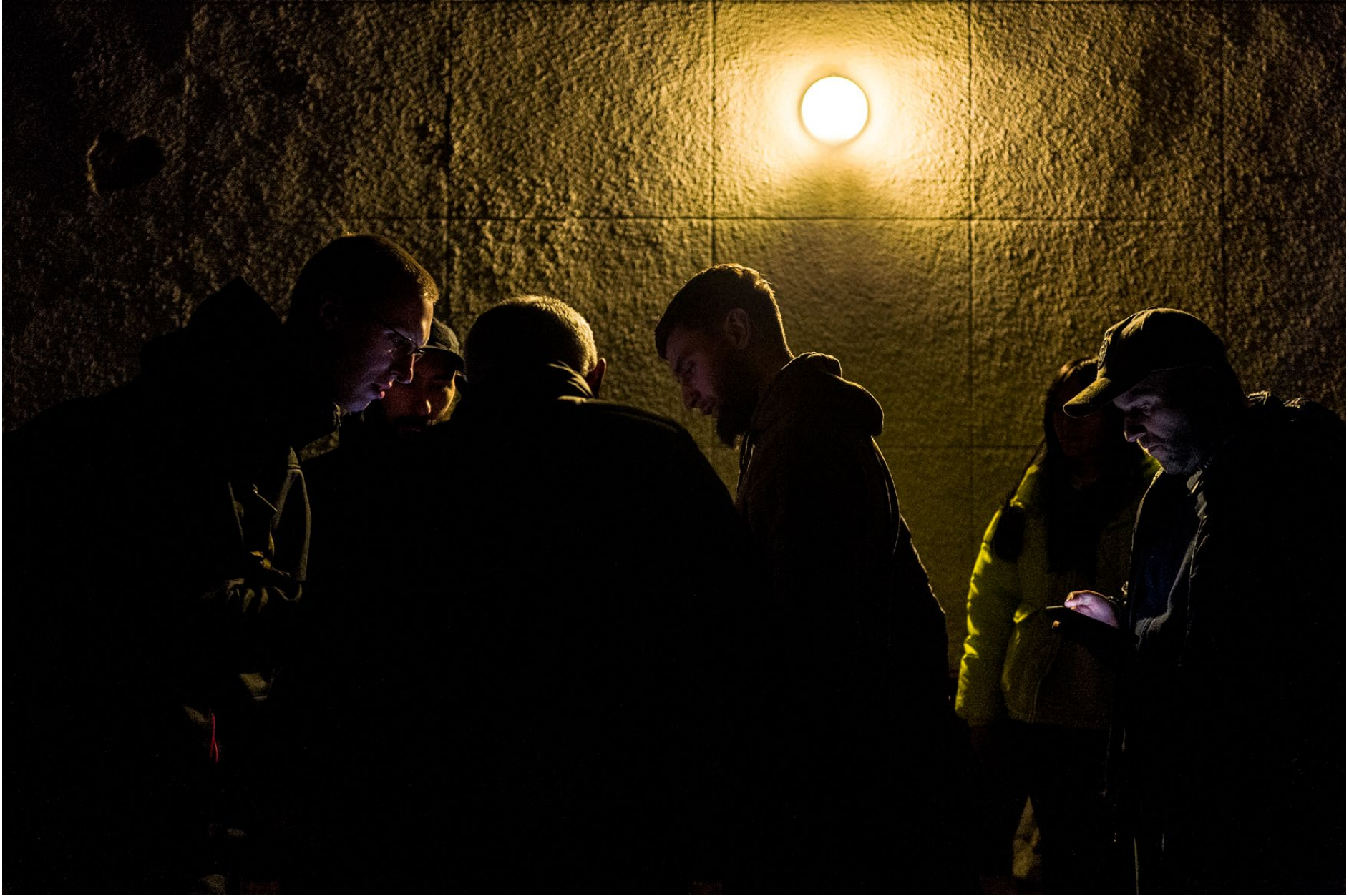
Warsaw, Belarusian House Association. Just before their departure the fighters finalize the details of the mission and communicate via Telegram with their contacts in Ukraine.