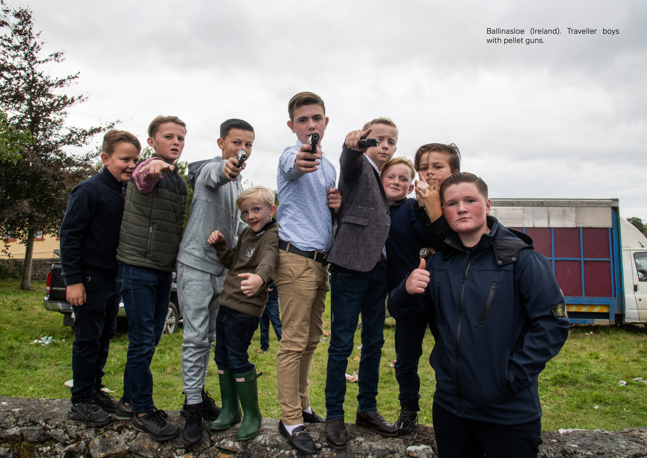
Ballinasloe (Ireland). Traveller boys with pellet guns.