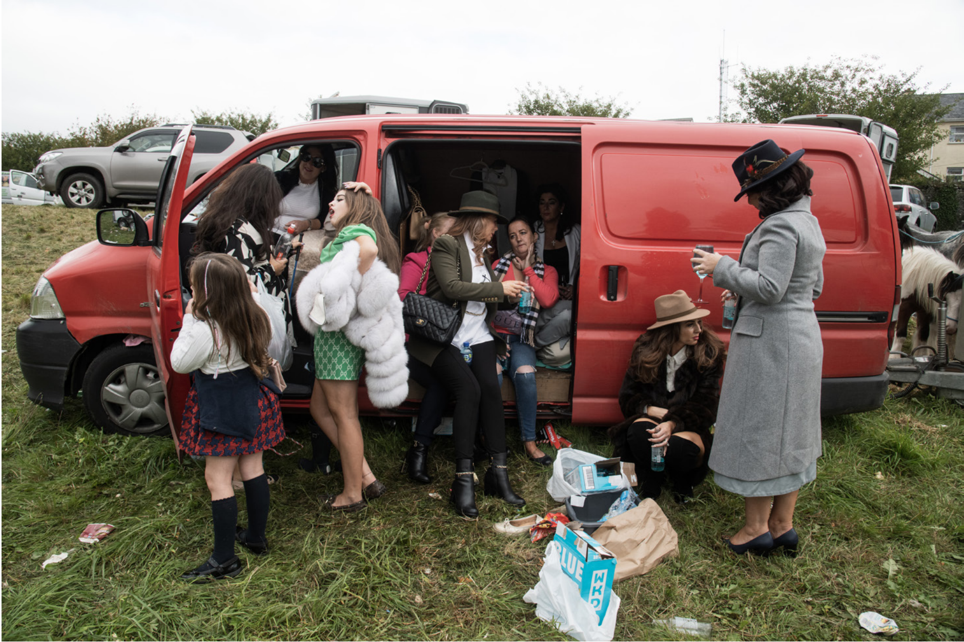
Ballinasloe (Ireland). Family and friends meeting up during the Ballinasloe Horse Fair.