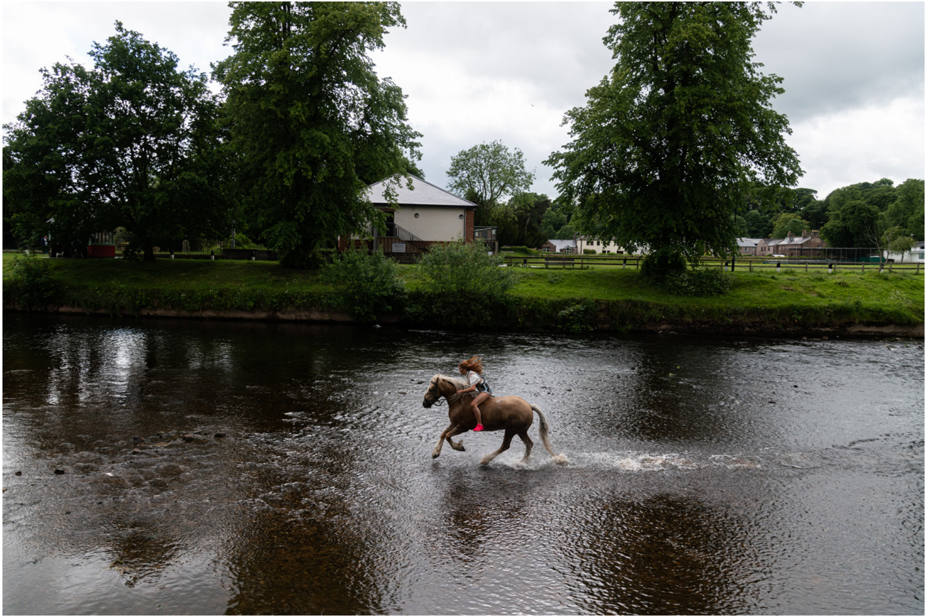
Appleby-in-Westmorland (England, UK). Galloping in the River Eden during the Appleby Horse Fair.