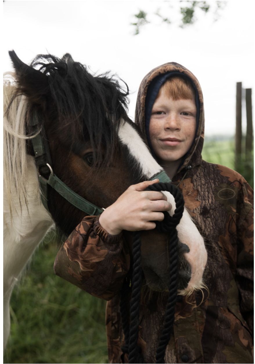
Appleby-in-Westmorland (England, UK). A young Traveller on his way back home from Appleby.