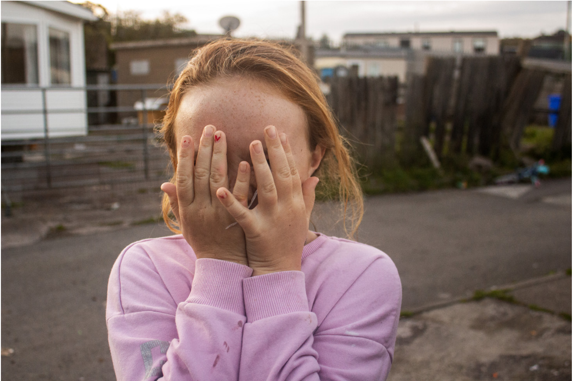
Cork (Ireland). A little girl at the Cork Halting Site.