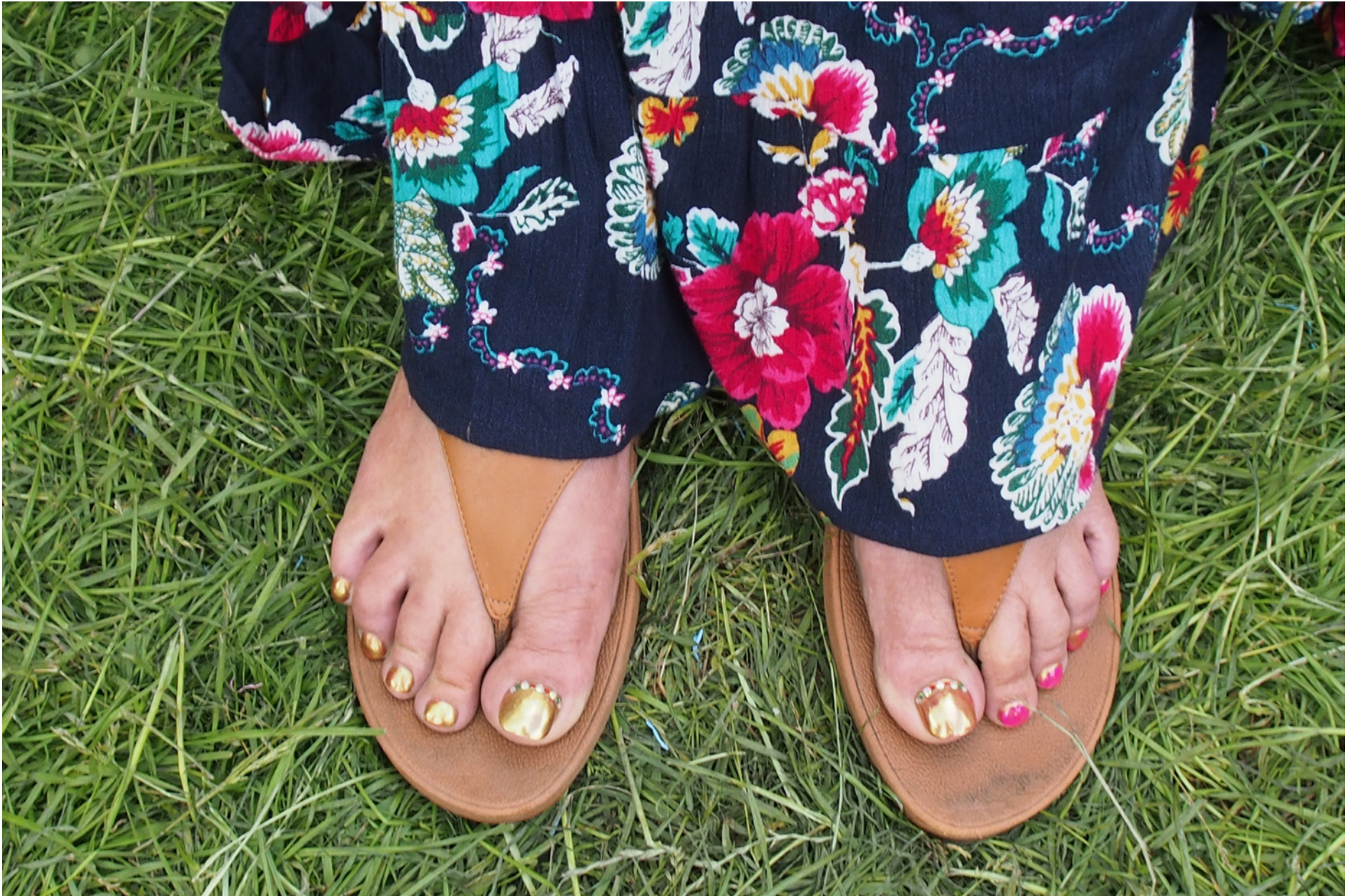
Appleby-in-Westmorland (England, UK). Coloured gypsy feet.