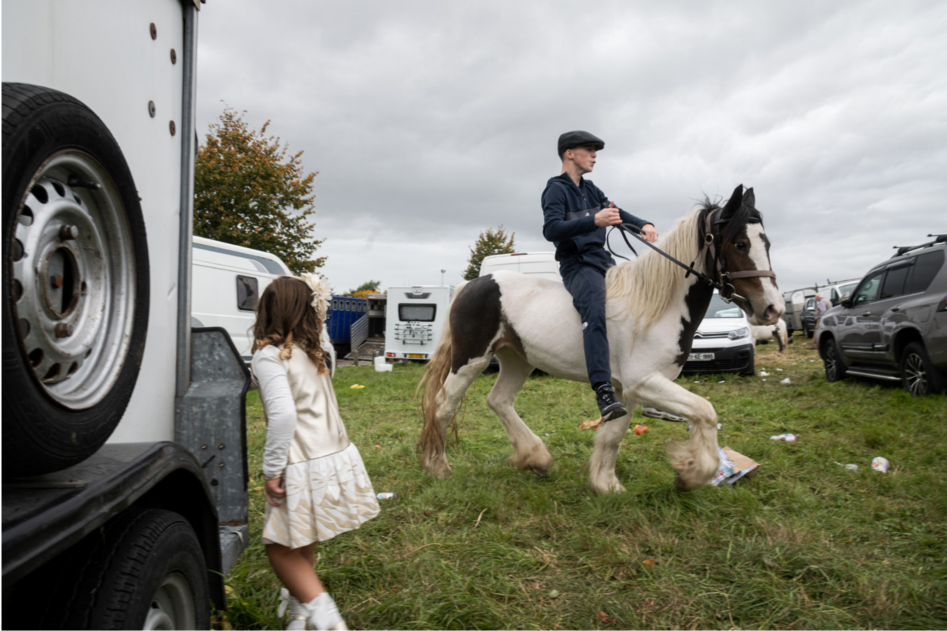
Ballinasloe (Ireland). An Irish Cob Horse among the caravans at the Ballinasloe Horse Fair.