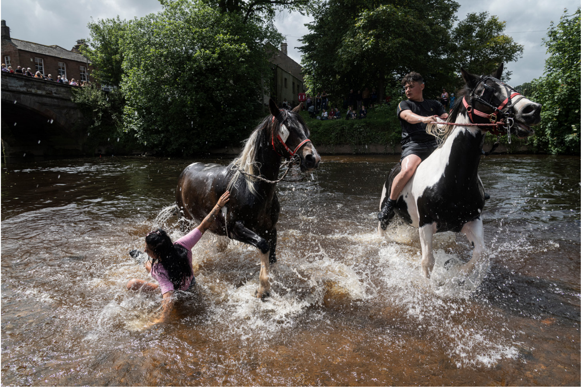
Appleby-in-Westmorland (England, UK). Horses in the River Eden.