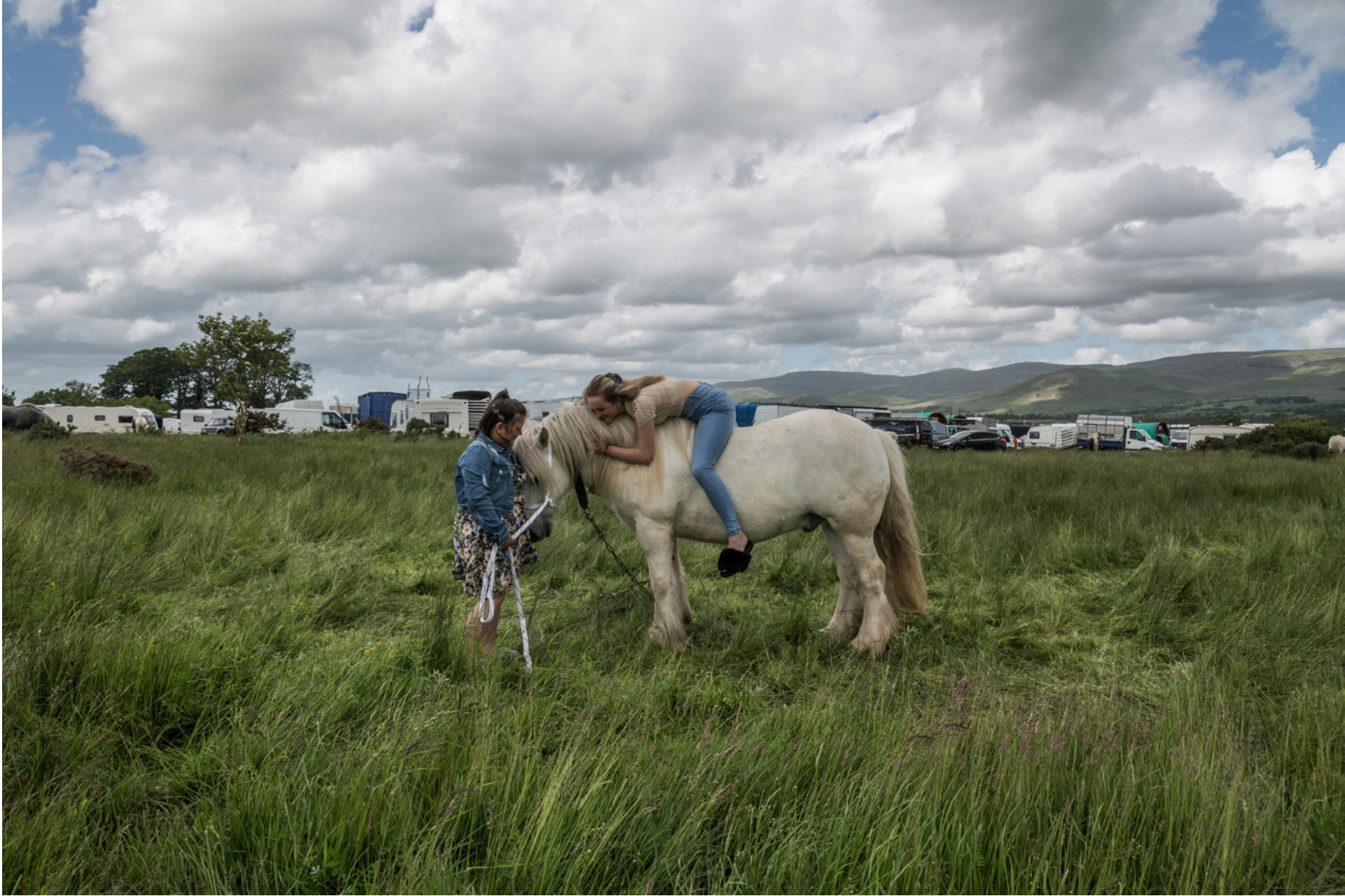
Appleby-in-Westmorland (England, UK). Two girls with their horse at the Appleby Horse Fair.