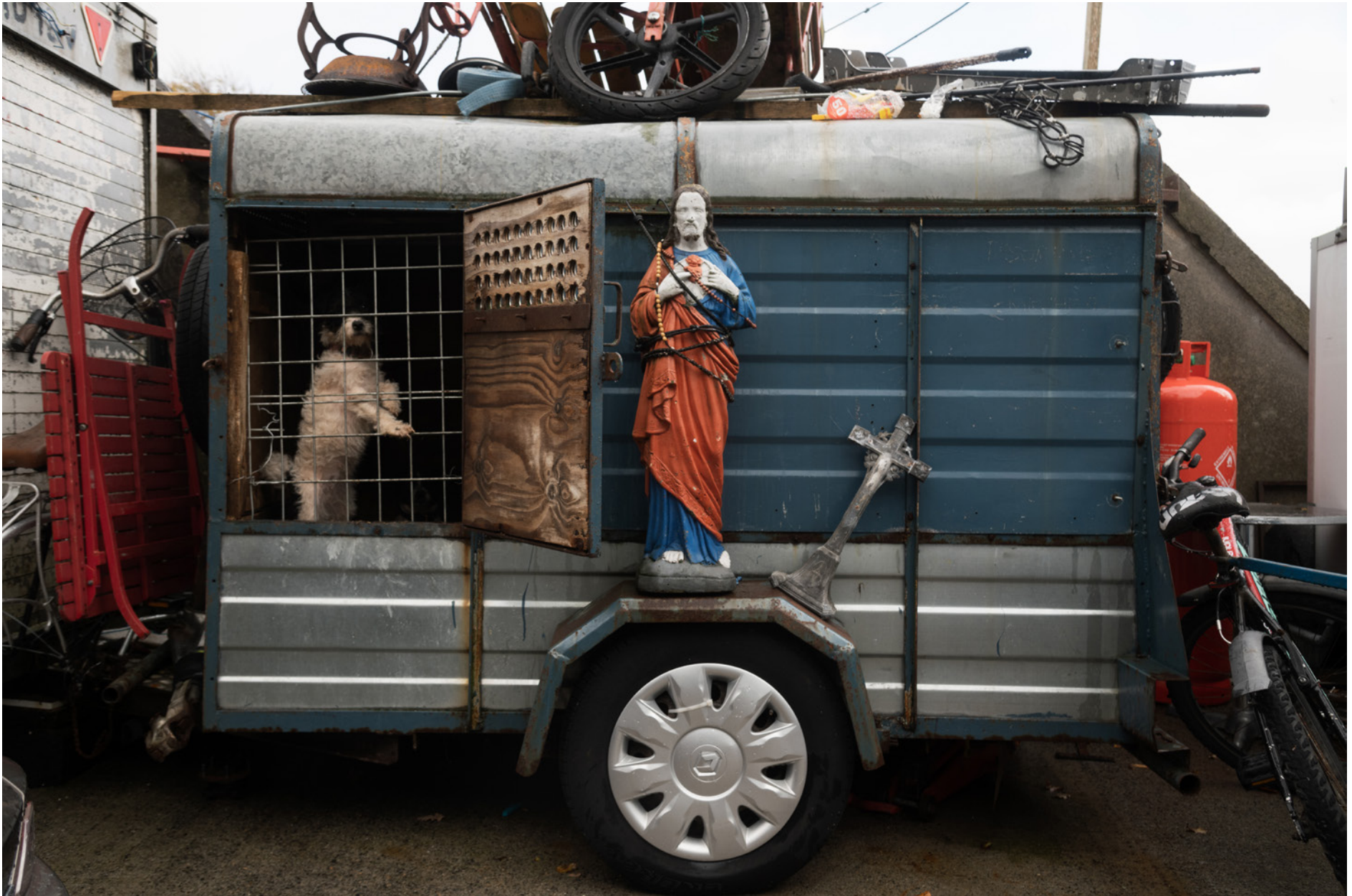
Galway (Ireland). A holy dog cart at the Cúl Trá Halting Site.