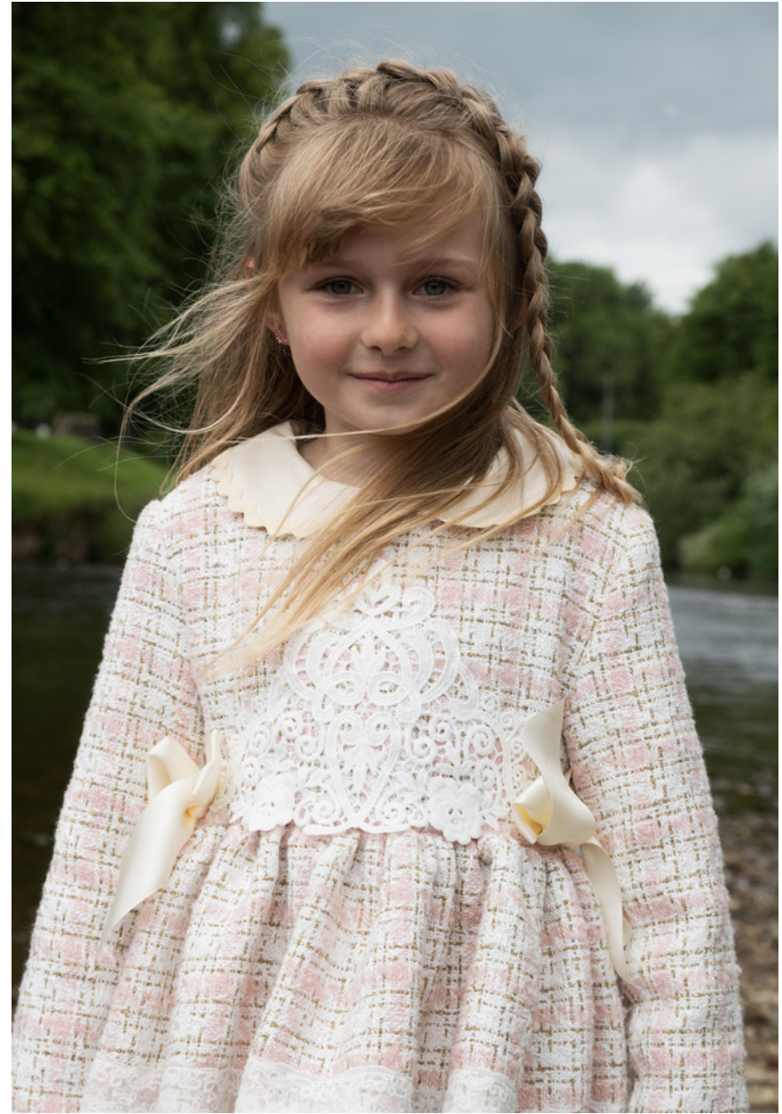
Appleby-in-Westmorland (England, UK). A little girl at the River Eden.