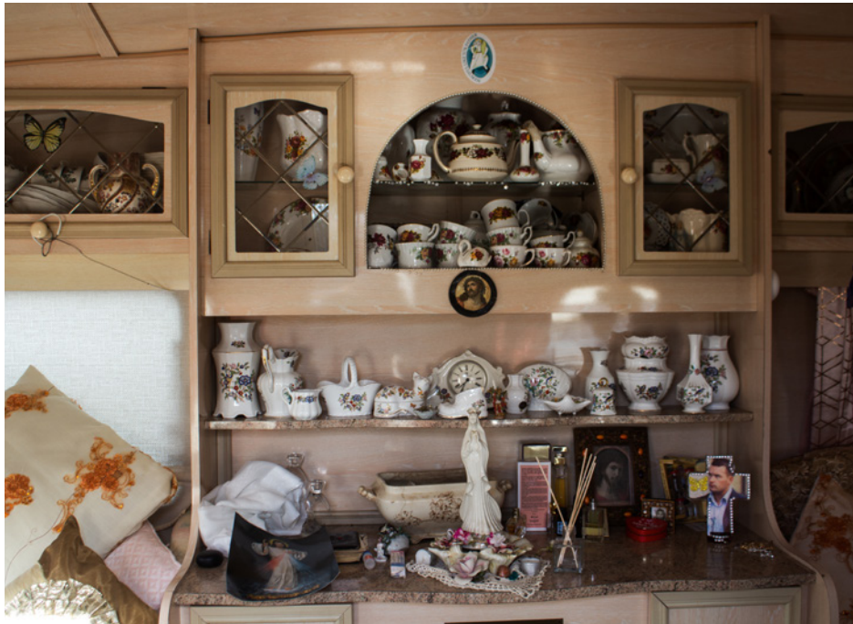
Dublin (Ireland). Dublin roadside camping. The interior of Lily's caravan, featuring a pottery collection and a photo of one of her children who died young.