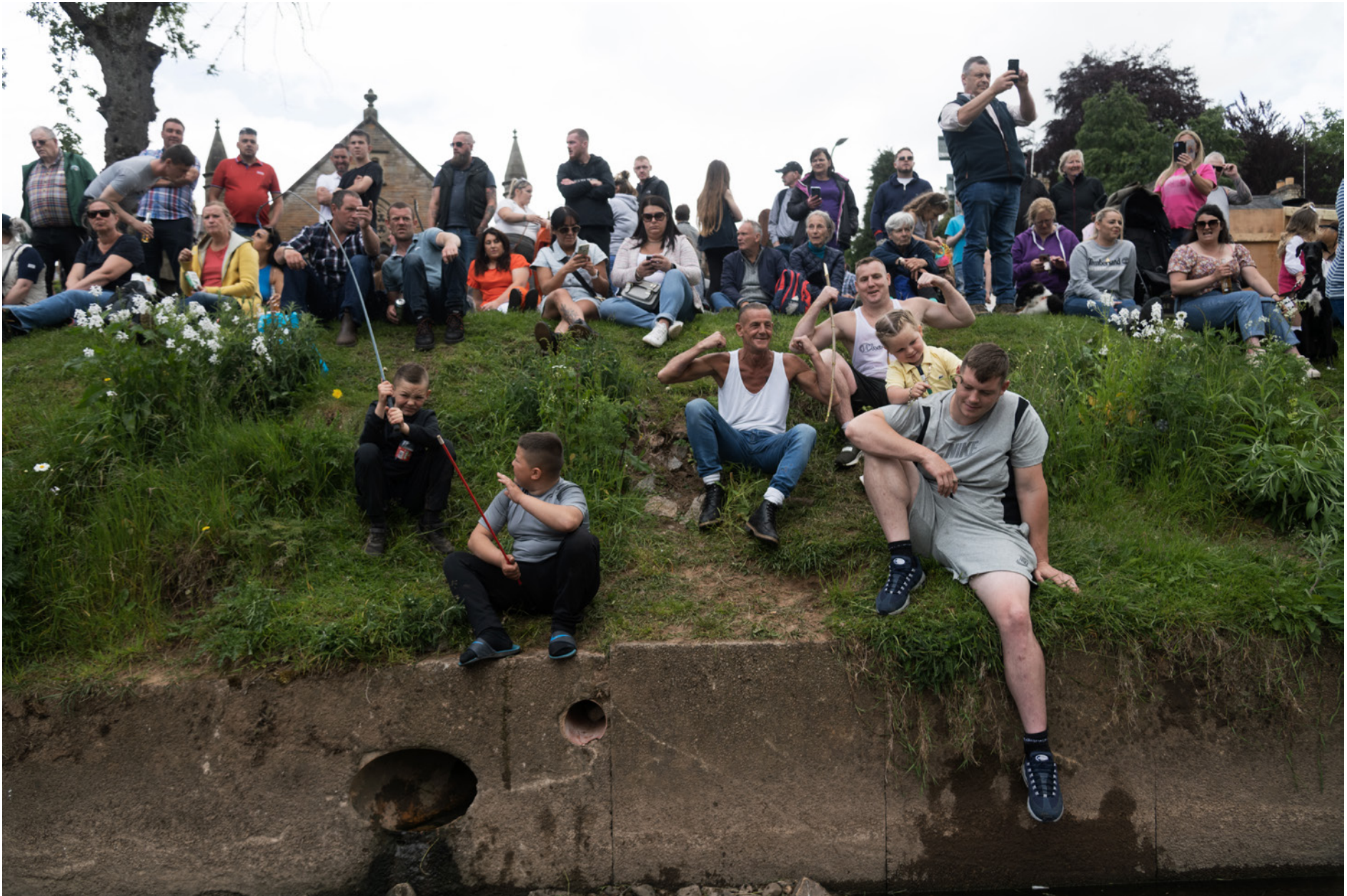
Appleby-in-Westmorland (England, UK). Travellers and locals on the banks of the River Eden at Appleby-in-Westmorland during the horse fair.