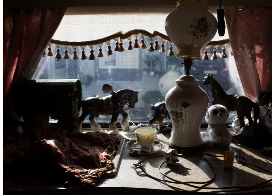
Dublin (Ireland). Travellers' ceramic ornaments.