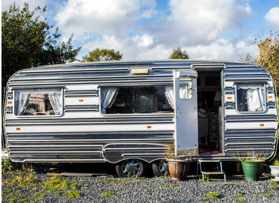
Dublin (Ireland). A vintage caravan at the Dublin Halting Site.