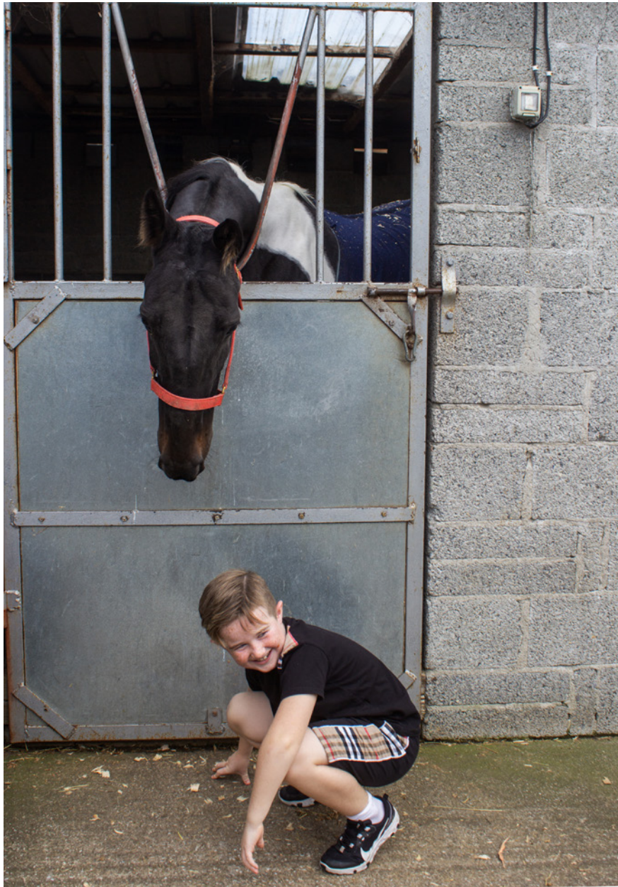
Limerick (Ireland). A little Traveller boy at the Limerick Halting Site.