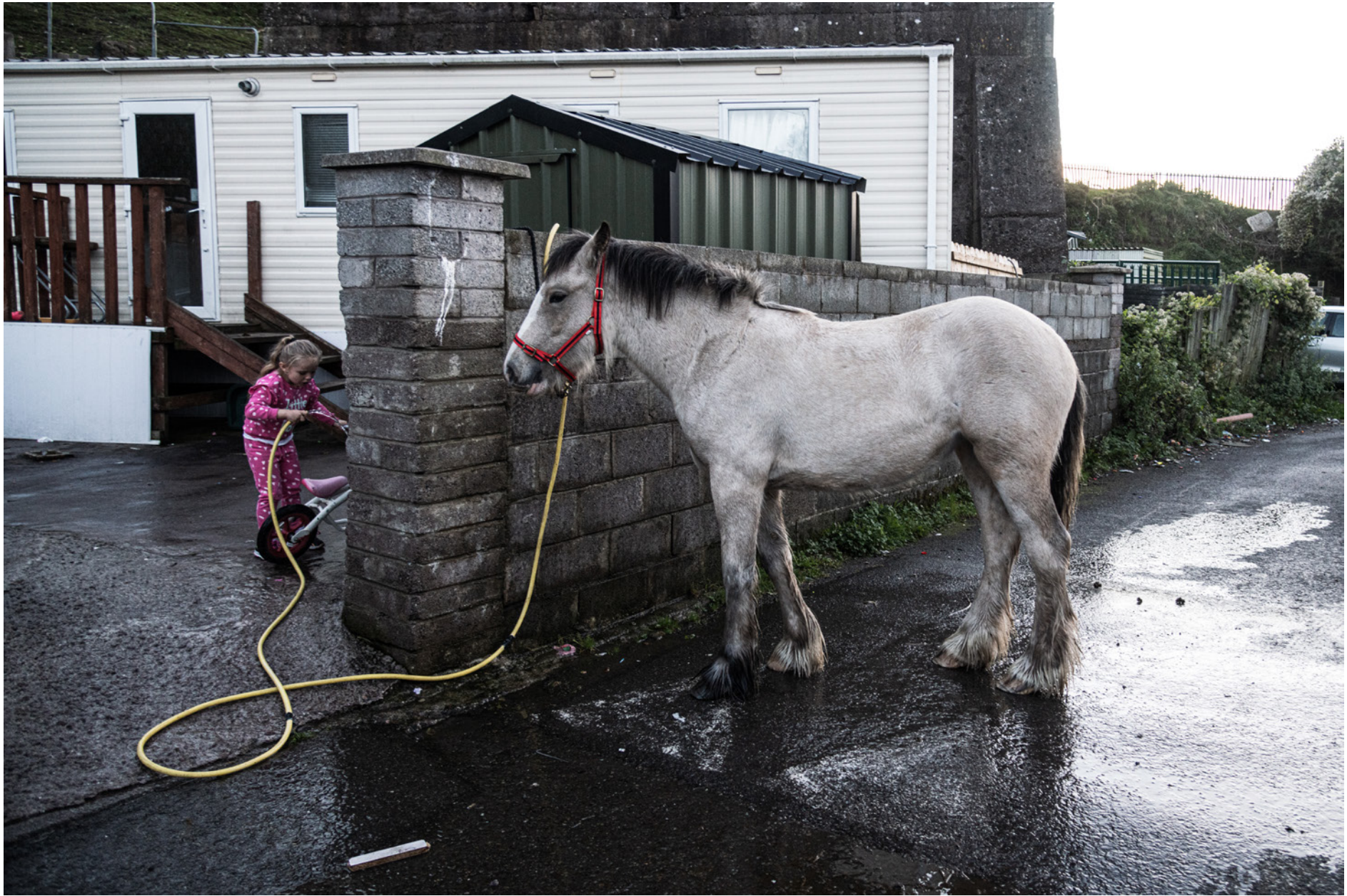
Cork (Ireland) Everyday life at the Cork Halting Site. An Irish horse waits to be washed down after a ride.