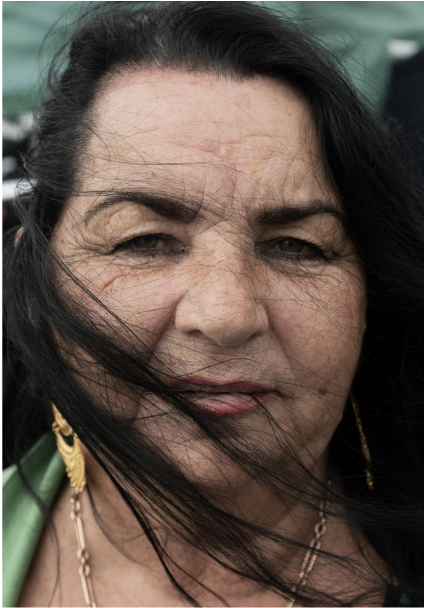
Appleby-in-Westmorland (England, UK). The gypsy queen portrait.