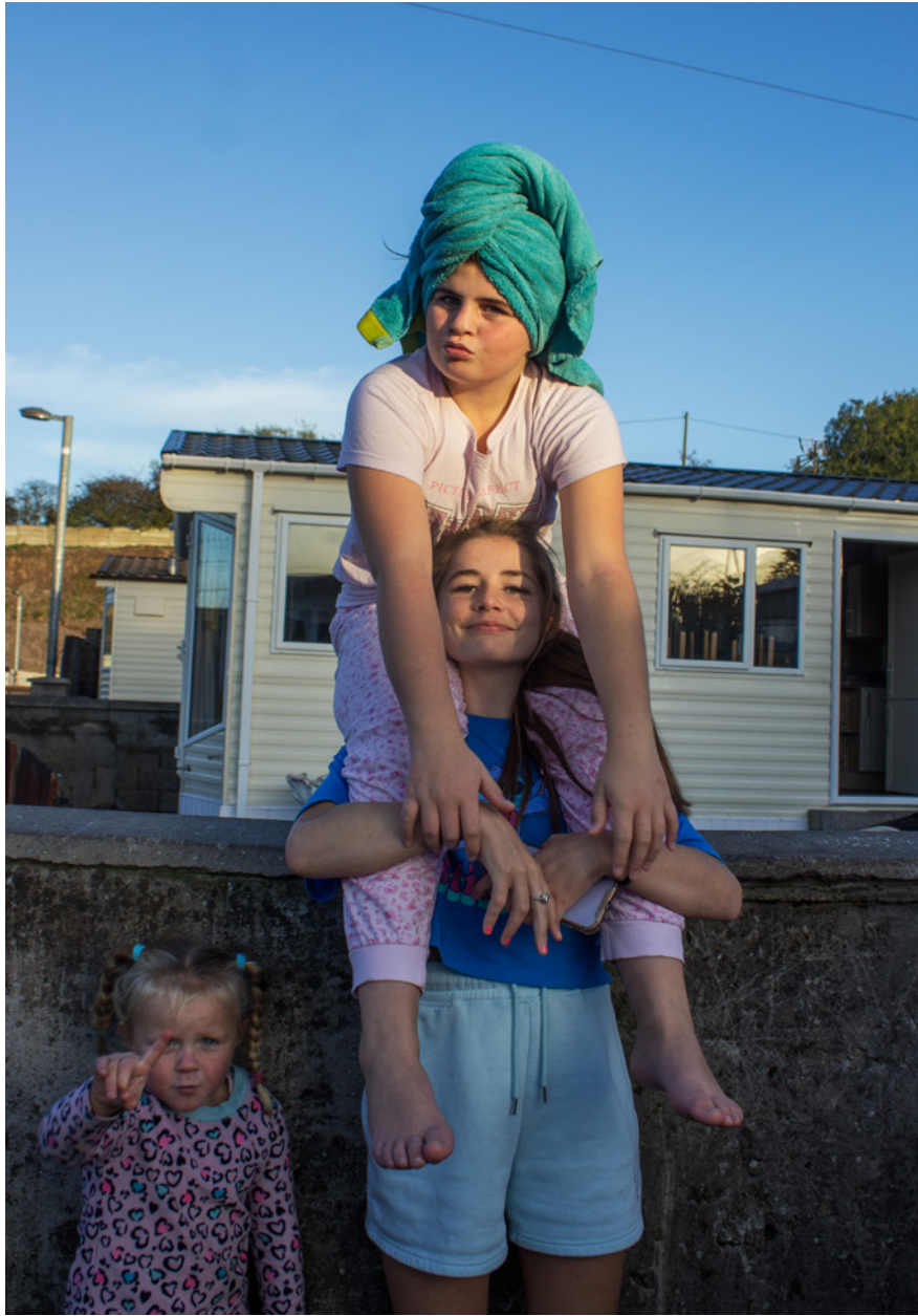
Cork (Ireland). Three little girls at the Cork Halting Site.