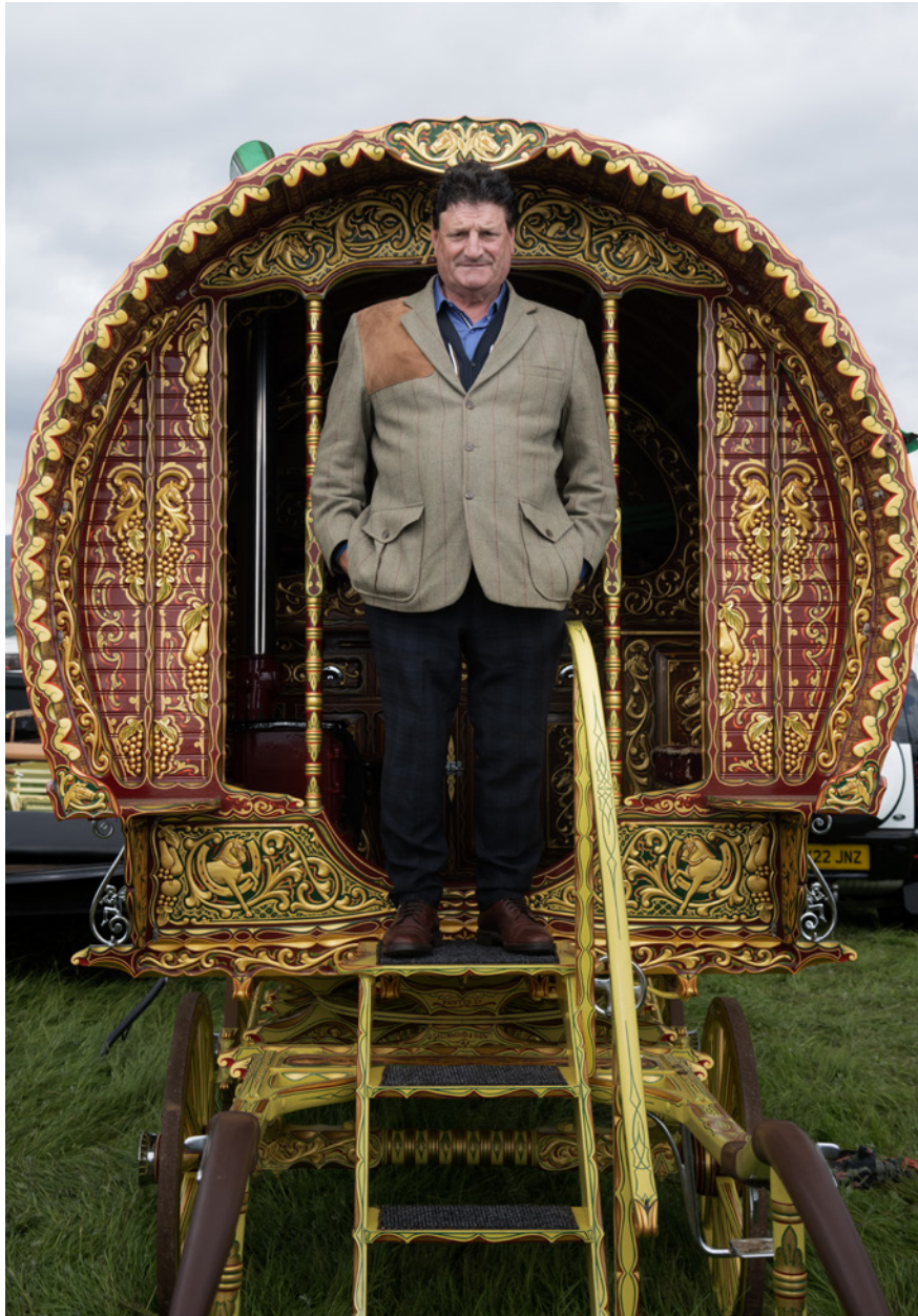
Appleby-in-Westmorland (England, UK). A Traveller and his vardo. The vardo is the traditional horse-drawn wagon used by British Travellers as their home. It is typically highly decorated, intricately carved, brightly painted, and even gilded.