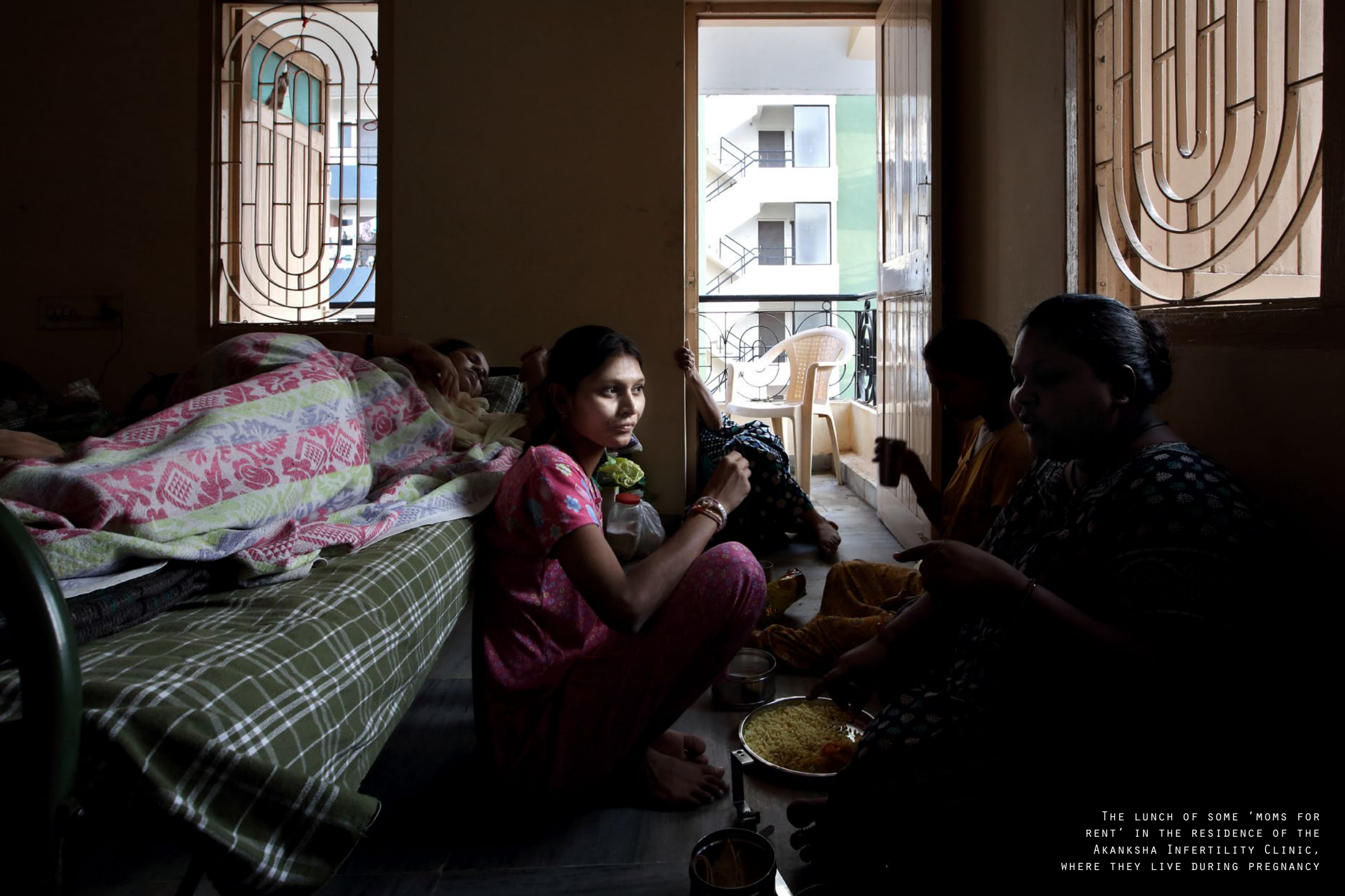
THE LUNCH OF SOME 'MOMS FOR RENT' IN THE RESIDENCE OF THE AKANKSHA INFERTILITY CLINIC, WHERE THEY LIVE DURING PREGNANCY