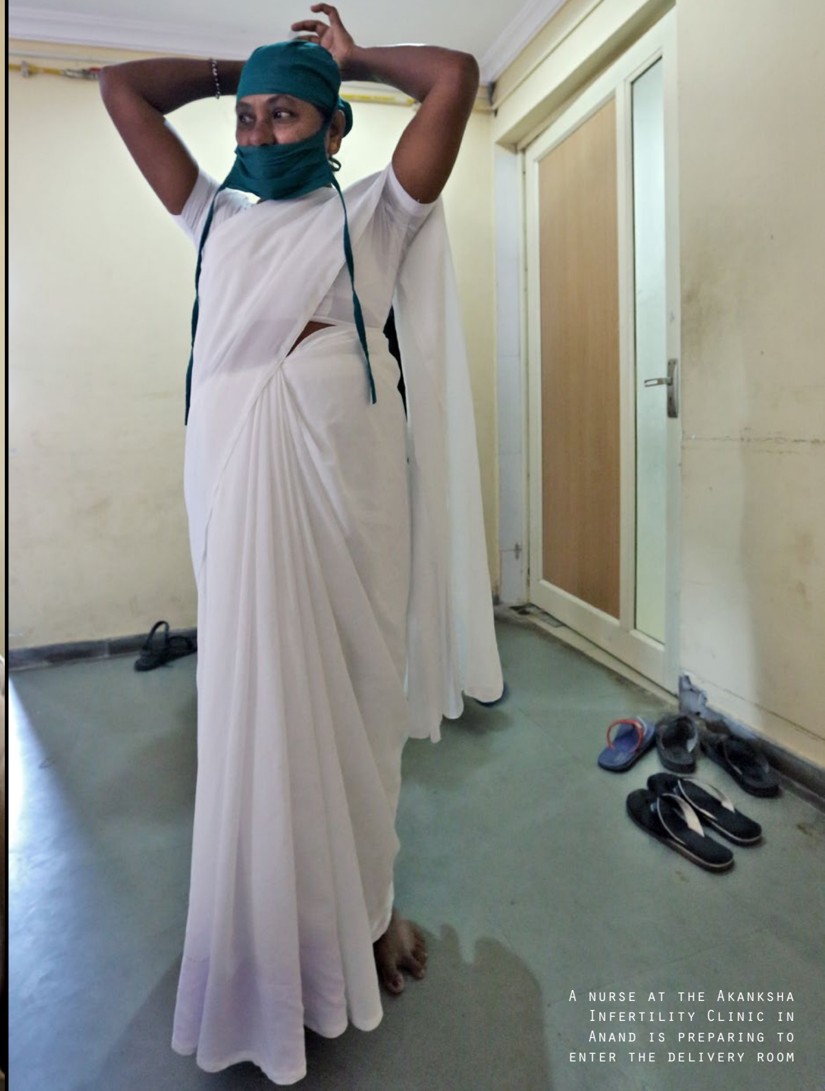
A NURSE AT THE AKANKSHA INFERTILITY CLINIC IN ANAND IS PREPARING TO ENTER THE DELIVERY ROOM