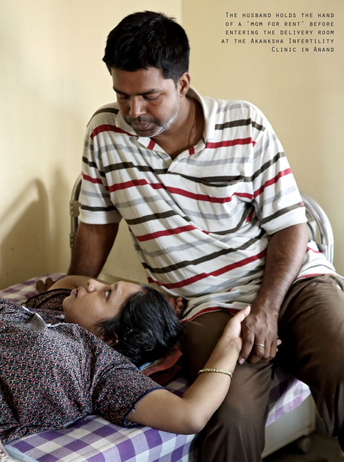
THE HUSBAND HOLDS THE HAND OF A 'MOM FOR RENT' BEFORE ENTERING THE DELIVERY ROOM AT THE AKANKSHA INFERTILITY CLINIC IN ANAND