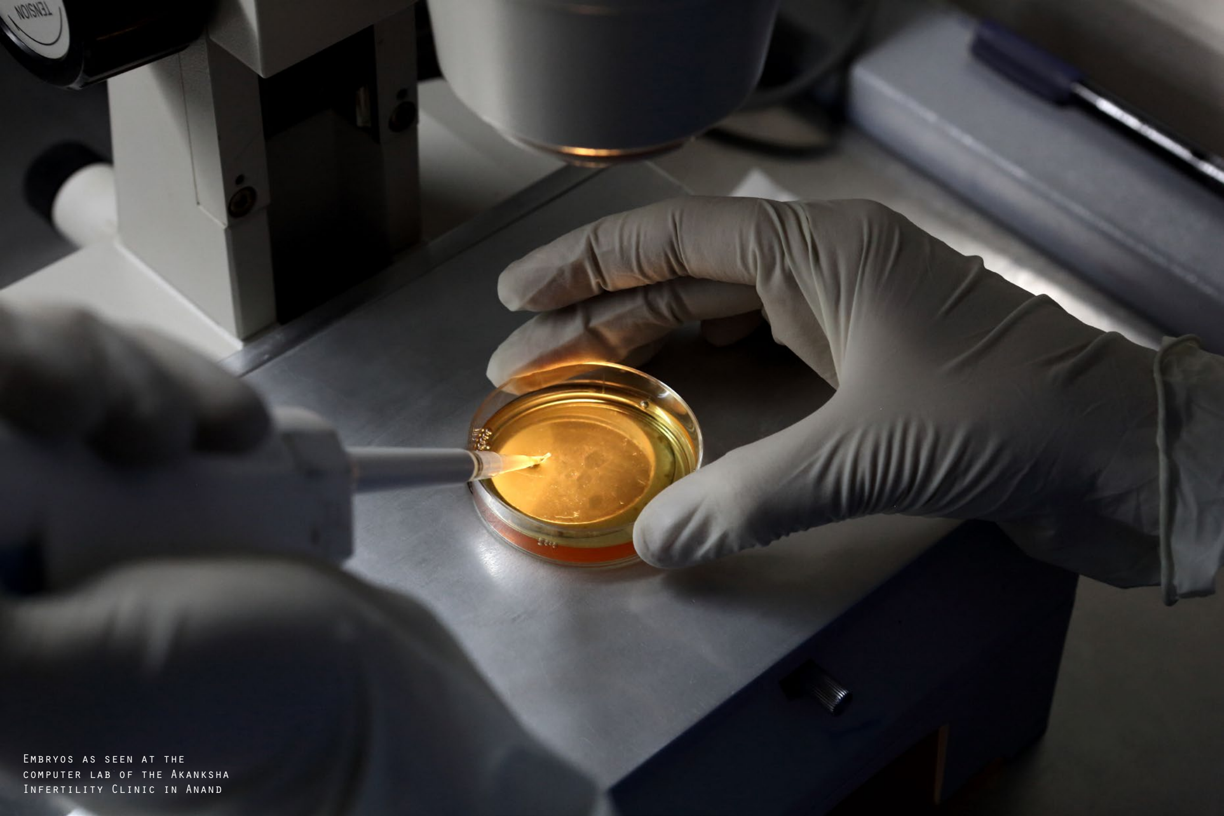
EMBRYOS AS SEEN AT THE COMPUTER LAB OF THE AKANKSHA INFERTILITY CLINIC IN ANAND