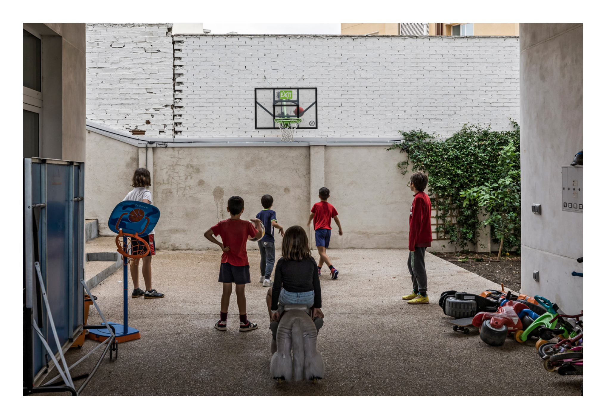
Madrid (Spain). Playing in the courtyard at the Las Carolinas building in Usera, a working-class neighborhood in Madrid's southern suburbs. The building is home to 17 families from the Entrepatios housing cooperative.