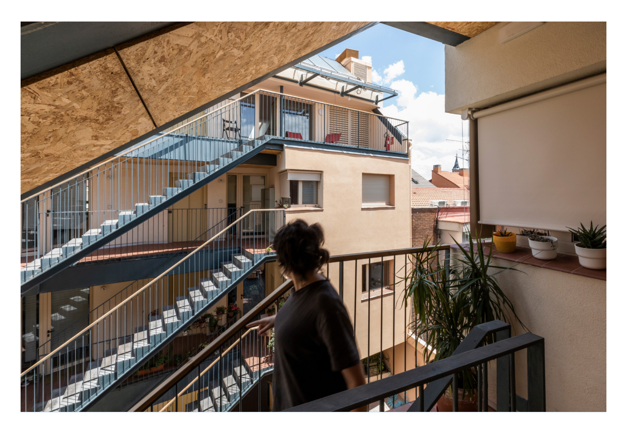
Madrid (Spain). The Entrepatios housing cooperative building in the working-class Las Vallecas neighborhood on the southern outskirts of Madrid.