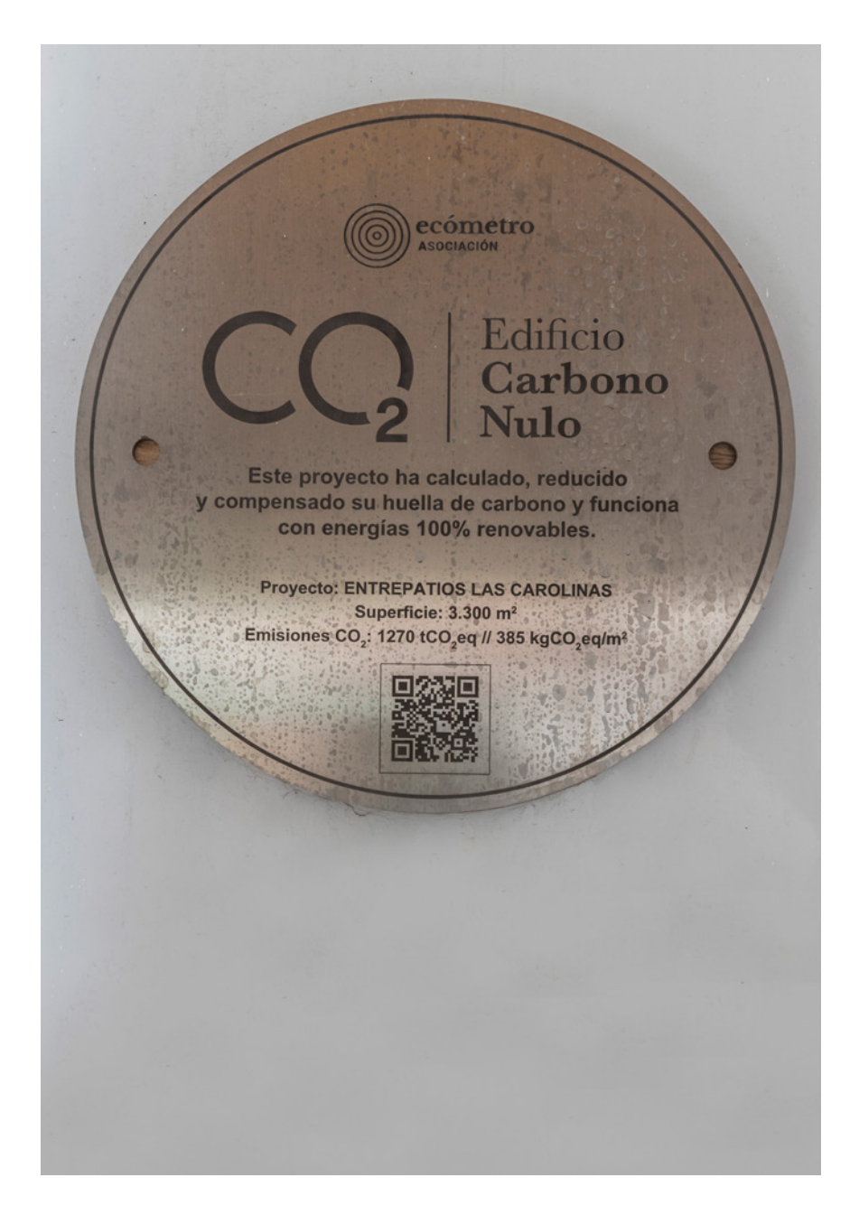
Madrid (Spain). The plaque at the Las Carolinas building certifying that it is zero-carbon.