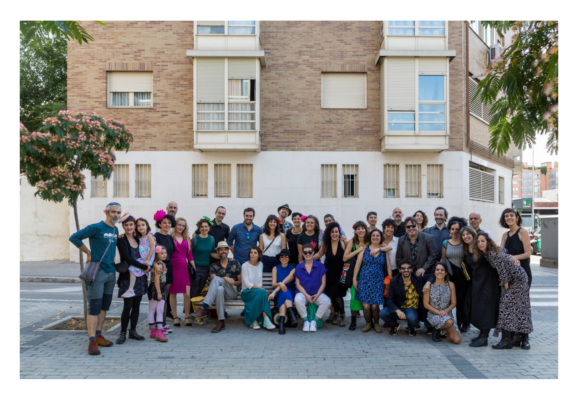
Madrid (Spain). A group photo of many inhabitants of the Las Carolinas building in Usera, a working-class neighborhood in Madrid's southern suburbs. The building is home to 17 families from the Entrepatios housing cooperative. They are on their way to a wedding party.