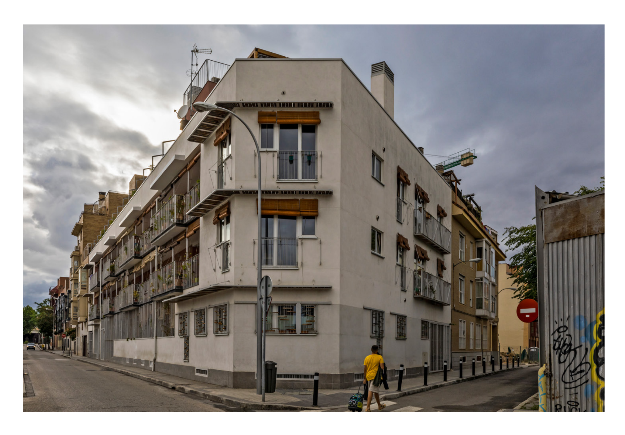
Madrid (Spain). The Las Carolinas building in Usera, a working-class neighborhood in Madrid's southern suburbs. The building is home to 17 families from the Entrepatios housing cooperative.