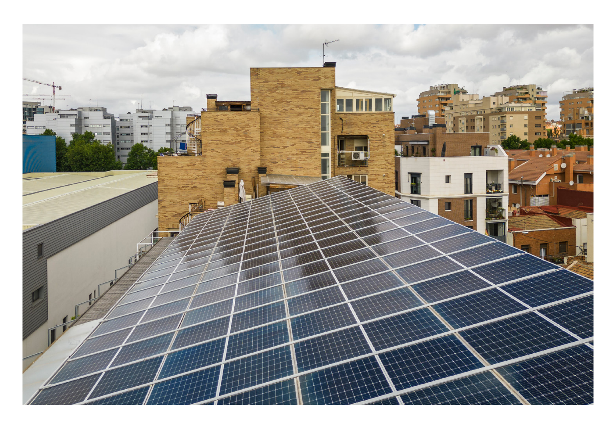
Madrid (Spain). Photovoltaic panels on the roof of the Las Carolinas building in Usera, a working-class neighborhood in Madrid's southern suburbs. The building is home to 17 families from the Entrepatios housing cooperative.