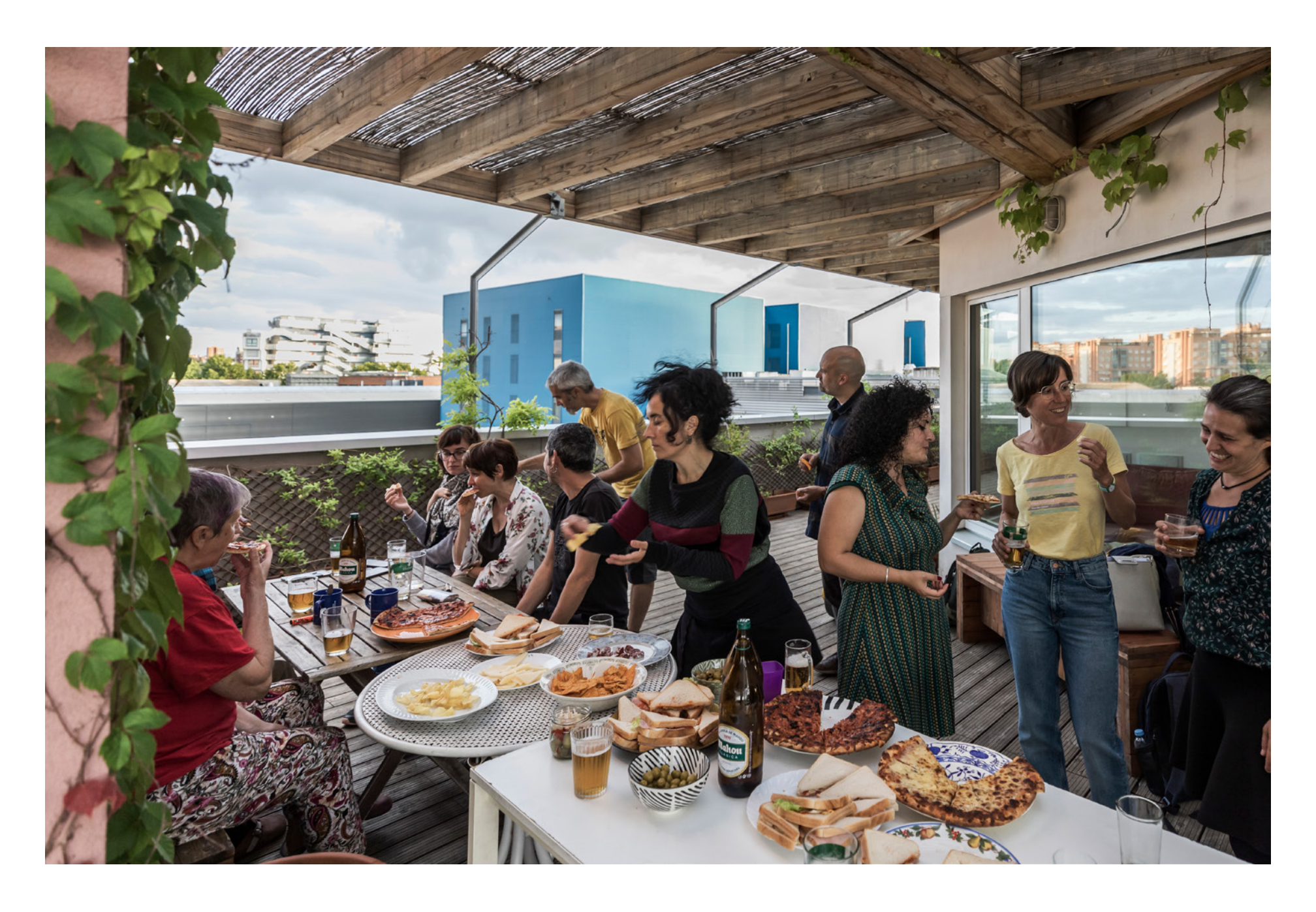
Madrid (Spain). A birthday party in the common spaces at the Las Carolinas building in Usera, a working-class neighborhood in Madrid's southern suburbs. The building is home to 17 families from the Entrepatios housing cooperative.