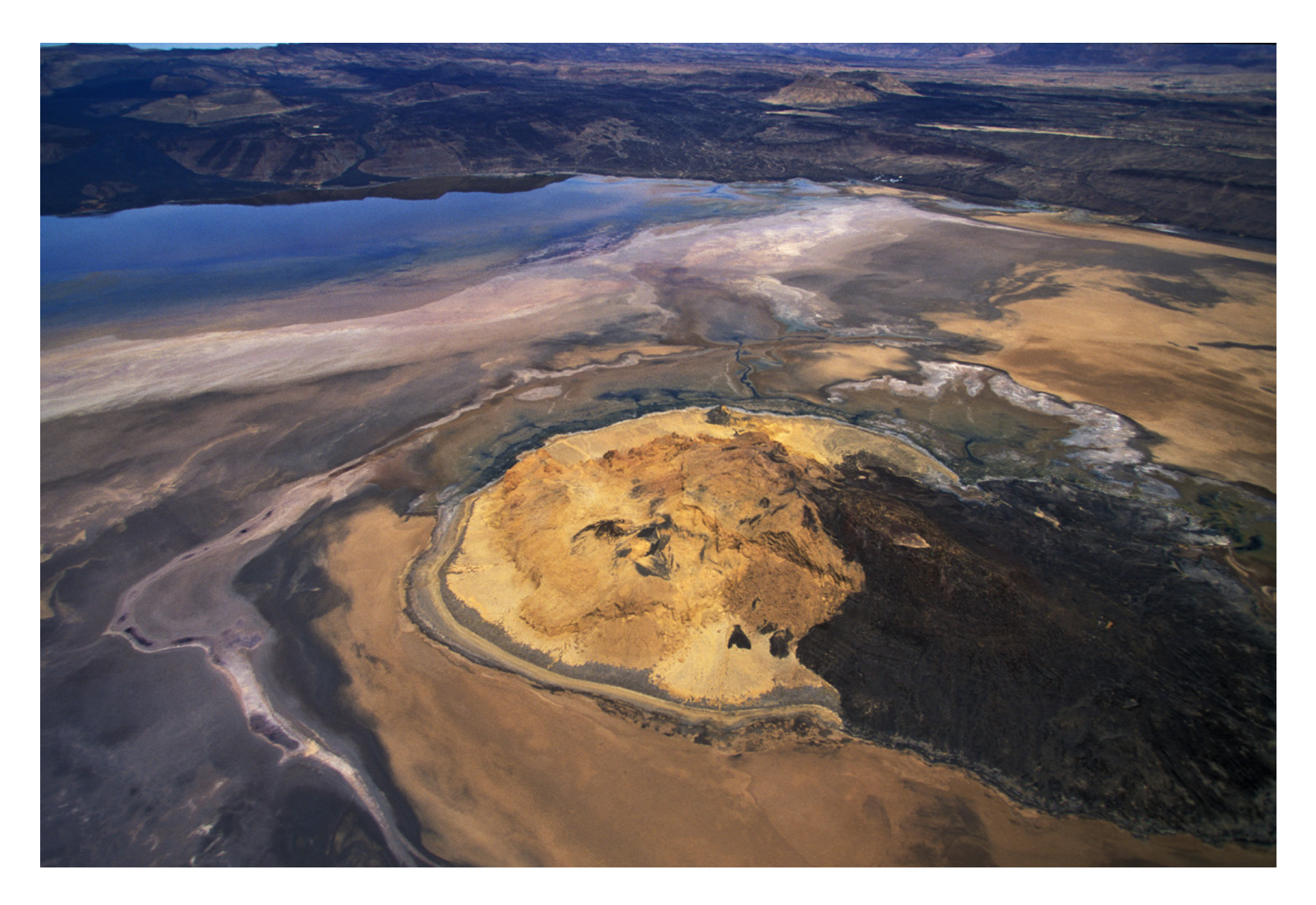
Lake Turkana (Kenya) - 2012 – An aerial view of the Suguta Valley's volcanic terrain at the southern end of Lake Turkana.