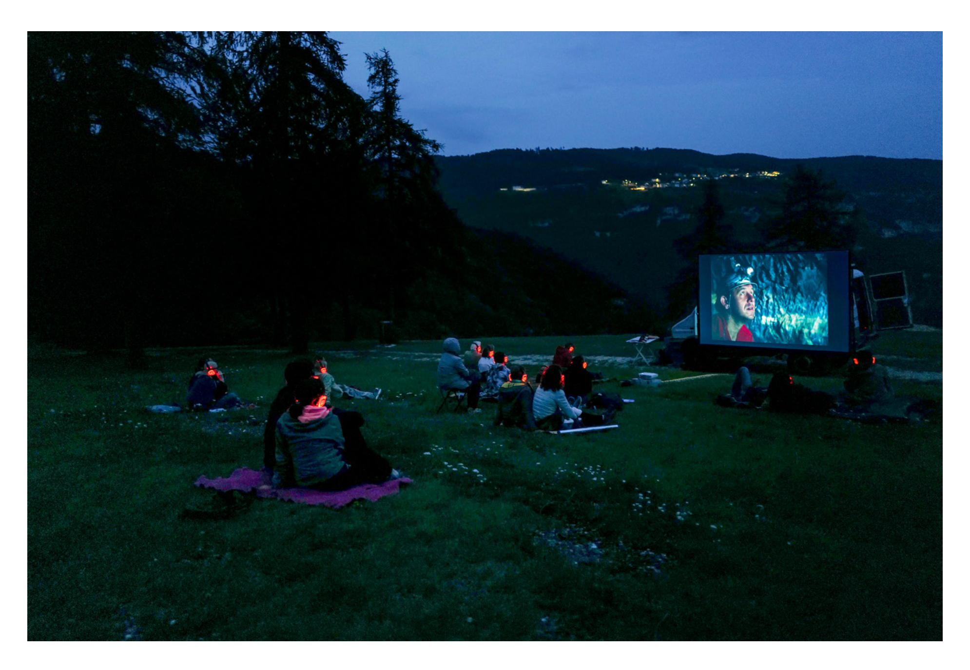
Lavarone Forte Belvedere-Gschwent (TN), Italy. Le Cinema du Desert participates in a summer film festival called "Whispers at Altitude." The screening is powered by solar energy, and the audio is transmitted through headphones to avoid disturbing the animals. Spectators can enjoy the film while sitting on a blanket in the silence of the night.