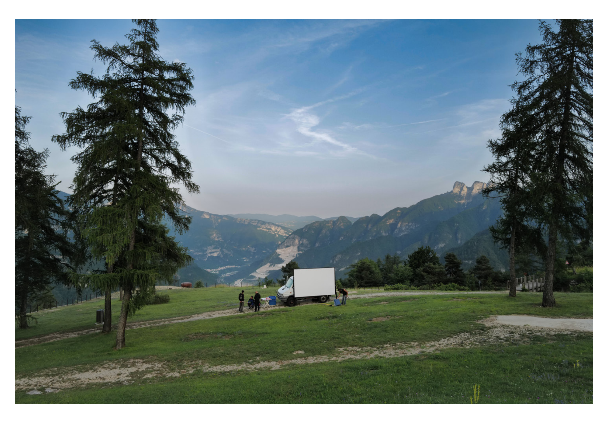
Lavarone Forte Belvedere-Gschwent (TN), Italy. Le Cinema du Desert takes part in a zero-impact summer film festival called "Whispers in the Valley." This time, they use a smaller solar-powered cinema truck to reach the clearing in the Cimbrian Alps.