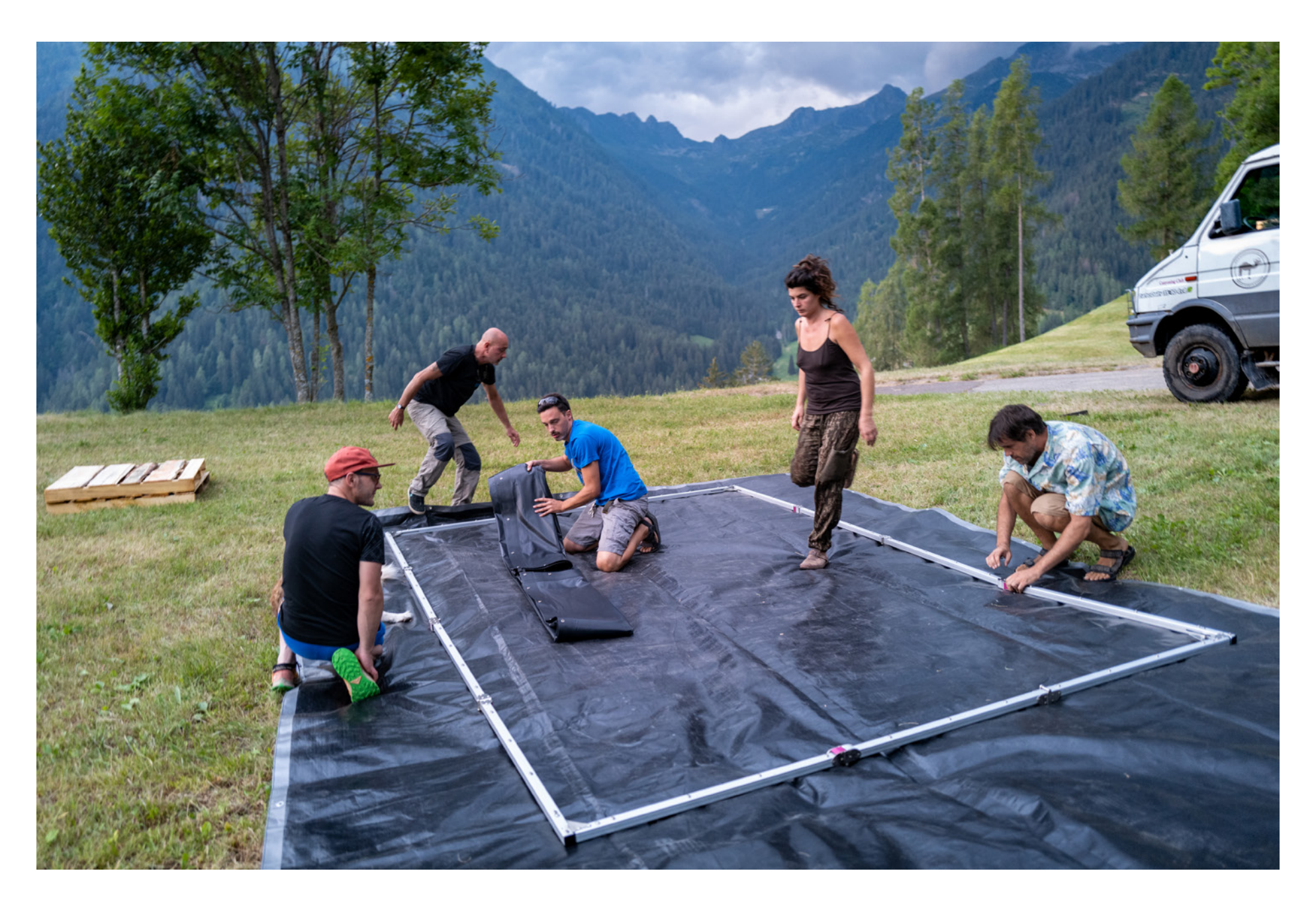
Rumo Val di Non (TN), Italy, inside the Maso Verde space, in collaboration with the Pro Loco, Le Cinema du Desert evening is being set up as part of the "Cinema under the Stars - Rumori e Visioni" event. The assembly of the screen, which was transported with the solar-powered truck, is taking place, and pallets are being positioned for the audience to sit on.